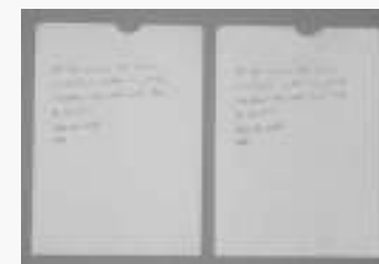
original copy water damaged copy

While using this system does save time and resources, there are some drawbacks. Pigment ink can be somewhat water soluble, therefore we tested the water solubility of this ink system before putting it to use in this application. In our tests, inks did not bleed through the enclosure so it would not be likely to transfer to the negatives in a real water event. While there was some minor bleeding, the inscriptions were still completely legible after submerging in water and then allowing to dry, as seen below.