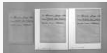
original color copy black and white copy

Some of his findings of the printer and ink system that were promising for this application were the light stability, resistance to high humidity, and color balance ratings. Since the original enclosures can be printed in both color and black and white, it is important that the color balance also be stable.