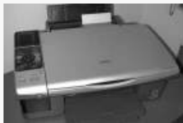
Epson Stylus CX6000 3-in-1 Inkjet System

Preserving information contained in historical inscriptions is a constant need in archival practice permeating the boundaries of academic, governmental, and scientific institutions. Often many hours and dollars are spent having staff manually copy historical inscriptions from their original enclosures onto new archival storage materials. And commonly, necessary rehousing projects are indefinitely postponed due to labor cost or fear of transcription error, particularly in cases dealing with technical inscriptions, those that are partially illegible, or inscriptions in a foreign language. By utilizing an inkjet copier, transcription error is eliminated. The overall costs are also greatly reduced, making seemingly impossible projects suddenly much more feasible.