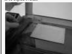
magenta filter being used to improve copy quality of a light inscription

In addition, when experimenting with the copying of very light pencil inscriptions, there is no way to manually adjust the density on the CX6000 3-in-1 system itself. Density manipulation was achieved through colored filters (available from stage lighting suppliers) which were used between the original and the glass directly on the scanning bed. This offered the manipulation sometimes necessary to achieve a successful copy. Yet, while the original inscription was darkened by the colored filters, so too was the background of each enclosure, causing a darker background tone to be copied overall.