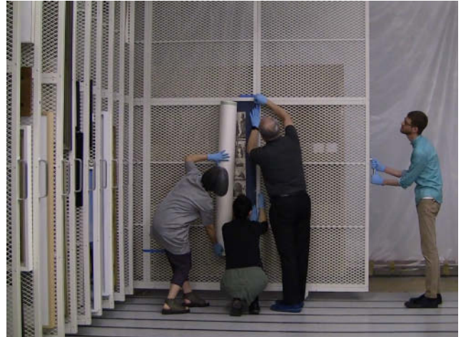
Fig. 6. Installation.