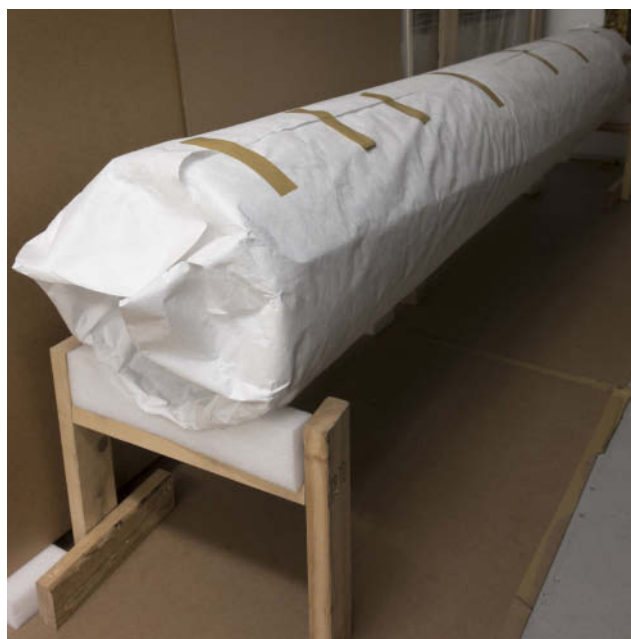
Fig. 1. Rolled oversized work on paper.

Tips presented at the Book and Paper Group Session, AIC's 46th Annual Meeting, May 29–June 2, 2018, Houston, Texas