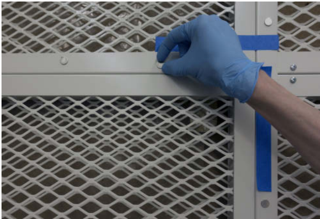
Fig. 4. Magnets on the screen just outside of the marked area.