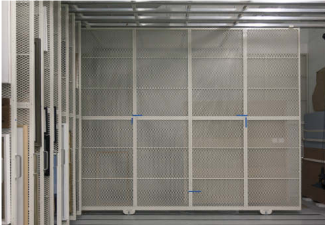
Fig. 3. Installation position marked on the screen.