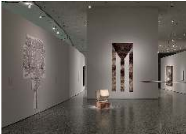
Fig. 1. Installation view of Contingent Beauty: Contemporary Art from Latin America , 11/22/2015-2/28/2016 at the Museum of Fine Arts, Houston. (Left) Johanna Calle, Perímetros (Urapán) , 2012, typed text on notarial ledger book paper, 280 x 200 cm.

display wall in locations that corresponded to the magnets in the Vivak® strips. A Vivak® template, with holes drilled in the same locations as the magnet-embedded strips, simplified positioning the metal screws during installation. The folios were hung along the top edge, allowing the bottom of the sheet to hang freely (a preference of both the artist and curator). When de-installed, the Vivak® strips were removed, the pockets were kept on the verso of the work, and all components were stored in a compact storage housing constructed from common archival storage materials (fig. 4).