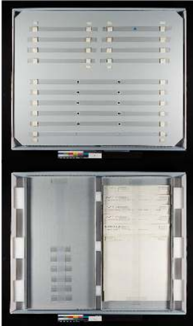
Fig. 4. (Top) upper level of storage box showing Vivak® strips with embedded magnets secured with twill tape; (Bottom) lower level of storage box showing removable trays holding folios with Mylar clips and polyethylene strap.

CHRISTINA TAYLOR C. E. Horton Fellow, Paper Conservation Museum of Fine Arts, Houston Houston, TX ctaylor@mfa.org