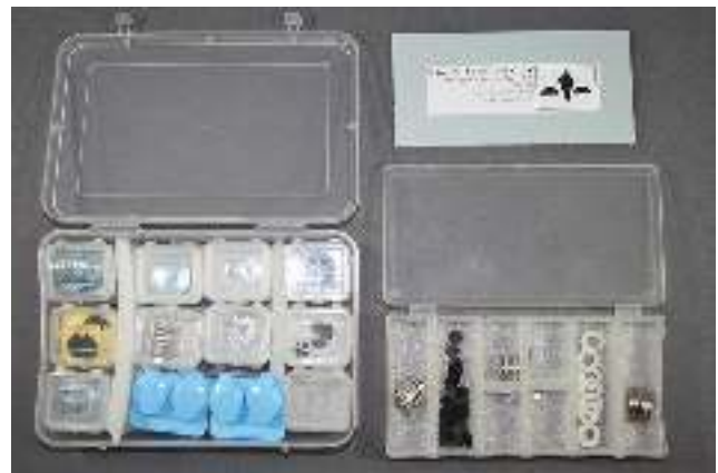
Fig. 1. Solutions for storage of rare earth magnets, showing a range of box sizes and styles. Ethafoam sheet lining placed in the boxes provides cushioning of the magnets.

One of the survey questions focused specifically on how conservators stored their magnets. As a response, here are a few rules of thumb: