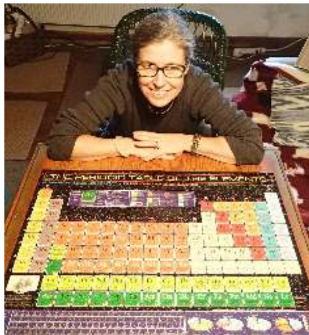
Fig. 4. The author after having completed the Periodic Table puzzle.

The jigsaw puzzle that was started over the holidays was completed by filling in the Lanthanides. It is hoped that this introduction will entice all conservators to put another tool—rare earth magnets—in their tool box. Perhaps this will encourage conservators to develop systems to reuse magnets better, and to create reusable standardized systems for mounts. The field of art conservation will benefit greatly from using rare earth magnets. As we do so, let us in this, and in other aspects of our work, be aware of “best environmental practices” just as we do our best to follow best practices in our treatments. (fig. 4)