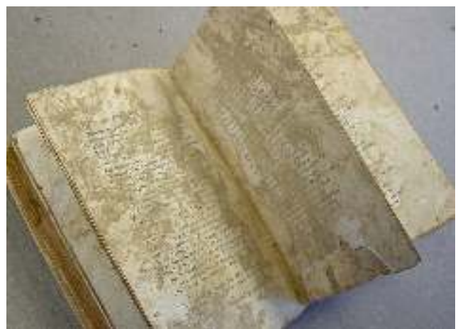
Fig. 9. Mud on text pages. Young, Edward. Night Thoughts on Life and Immortality. Philadelphia: John B. Perry, 1855. National Park Service, Gettysburg National Military Park, GETT 4490.