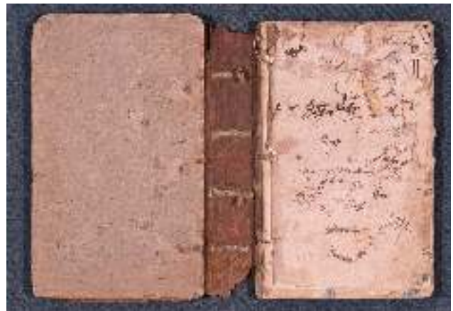
Fig. 7. Front board and pastedown. A View of Antiquity . London: Thomas Parkhurst and Jonathan Robinson, 1677. Yale College Library of 1742, General Collection, Beinecke Rare Book and Manuscript Library, Yale University.

The second treatment proposal that I'd like to discuss is more likely to be affected by bias on the part of the conservator as compared with the example of the Jonson First Folio. This copy of the 1677 edition of John Howe's A View of Antiquity has extensive damage. The leather covering material is completely detached from the front board and text while the pastedowns are detached from the boards. The original sewing supports are adhered to the leather and no sewing thread is present.