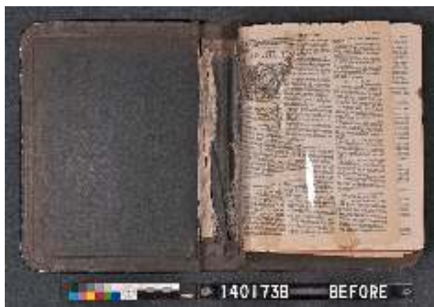
Fig. 4. Before treatment documentation of front interior hinge of Bible. Edward Kienholz. The Minister , 1961. Collection Albright-Knox Art Gallery Buffalo, New York. Charles W. Goodyear Fund, by exchange and Gift of Mrs. George A. Forman, by exchange, 2013. #2013:10a–c

you be judged—the folly of pointing out a small object in another's eye while ignoring a large beam of wood in your own. The passage in between, talking about measuring, references the butcher's scale. (Fig. 3)