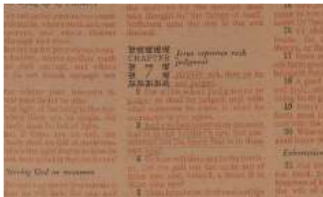
Fig. 3. Detail of page opening of Bible. Edward Kienholz. The Minister , 1961. Collection Albright-Knox Art Gallery Buffalo, New York. Charles W. Goodyear Fund, by exchange and Gift of Mrs. George A. Forman, by exchange, 2013. #2013:10a–c