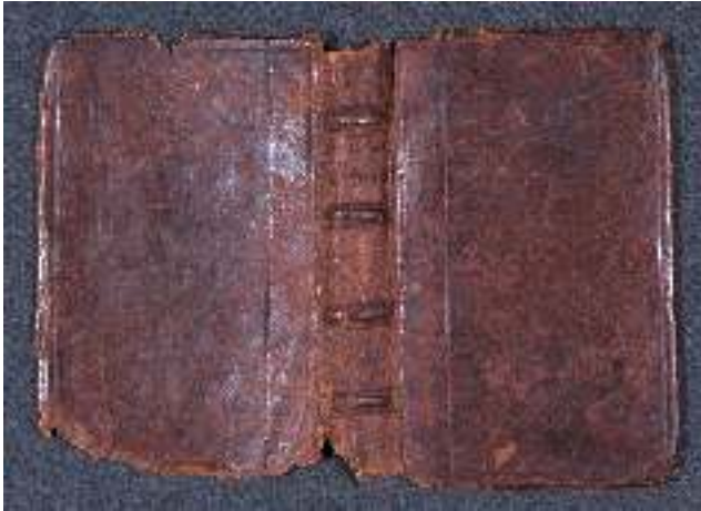
Fig. 8. Exterior of binding. A View of Antiquity . London: Thomas Parkhurst and Jonathan Robinson, 1677. Yale College Library of 1742, General Collection, Beinecke Rare Book and Manuscript Library, Yale University.

Pages are missing from the back of the volume, as is the back board of the binding. There is considerable staining to the last leaf of text demonstrating that it has been in contact with the covering leather for quite some time. Despite the extensive damage, the leather is quite pliable and the turn-ins, for the most part, are still attached.