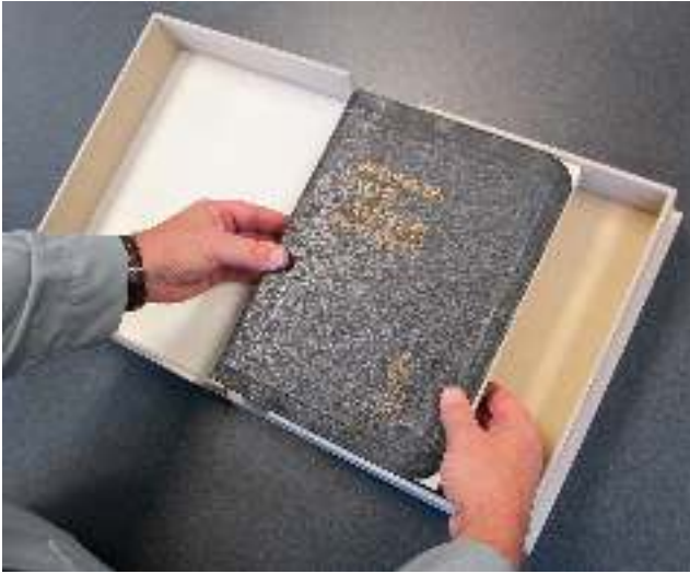
Fig. 12. The Bible in its custom-fitted enclosure. Edward Kienholz. The Minister , 1961. Collection Albright-Knox Art Gallery Buffalo, New York. Charles W. Goodyear Fund, by exchange and Gift of Mrs. George A. Forman, by exchange, 2013. #2013:10a-c

The after documentation of the Bible shows minimal visible change as a result of the treatment, even at the front hinge, which is not visible during exhibition. (Figs. 13–14)