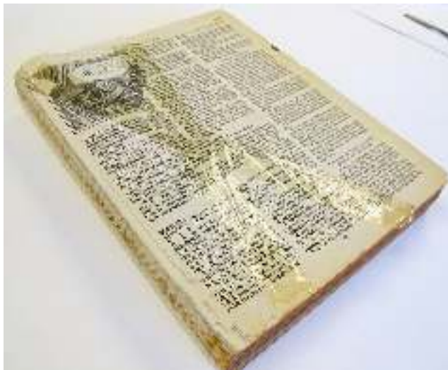
Fig. 10. The Bible during treatment. Edward Kienholz. The Minister , 1961. Collection Albright-Knox Art Gallery Buffalo, New York. Charles W. Goodyear Fund, by exchange and Gift of Mrs. George A. Forman, by exchange, 2013. #2013:10a-c

To return to the conservation treatment of the Kienholz Bible, our initial treatment preference proposed using fittings to hold the text in place in relation to the cover. The comprehensive treatment agreed upon with the staff at the Albright-Knox Art Gallery called for the cover to be reattached to the text block. Pressure-sensitive tape was removed only where absolutely necessary as Kienholz might possibly have applied the tape himself. The tape did have to be removed at the spine area so the text block could be released and repositioned during the conservation treatment. (Fig.