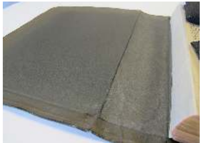
Fig. 11. Detail of the hinge across the interior of the spine of the cover. Edward Kienholz. The Minister , 1961. Collection Albright-Knox Art Gallery Buffalo, New York. Charles W. Goodyear Fund, by exchange and Gift of Mrs. George A. Forman, by exchange, 2013. #2013:10a-c