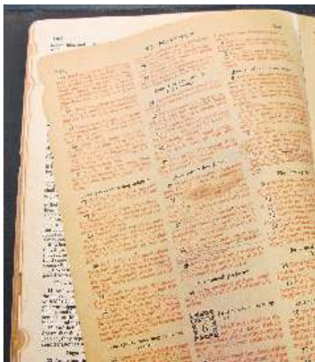
Fig. 2. Detail of page opening of Bible. Edward Kienholz. The Minister , 1961. Collection Albright-Knox Art Gallery Buffalo, New York. Charles W. Goodyear Fund, by exchange and Gift of Mrs. George A. Forman, by exchange, 2013. #2013:10a–c

The Bible appears to have been displayed at a particular page spread for a significant amount of time, as there is distinct discoloration to the pages and a preferential opening in the text at this location. (Fig. 2) This page opening is central to the meaning of the artwork. Born into a family of devout Protestant farmers in Washington State, Kienholz is pointing out the hypocrisy of religious self-righteousness. The underlined passages warn about the danger of judging others, lest