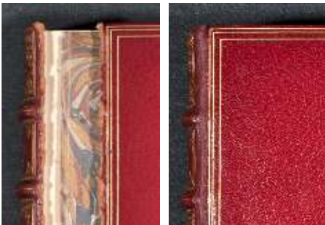
Fig. 6. Before and after detail of front hinge attachment. Jonson, Ben. The Workes of Benjamin Jonson . London: W. Stansby, 1616. Catherine Pelton Durrell '25 Archives and Special Collections Library, Vassar College

The binding was rebacked with unbleached airplane linen and Japanese paper toned to match the original leather color. The rounded spine of the rebacked volume is slightly flatter than the spine of the Riviere binding to improve the page opening. (Fig. 6)