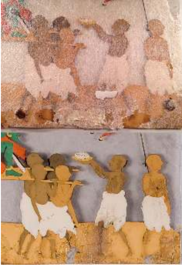
Fig. 6. Loose paint fragment and evidence of previous mounting methods. Painting 7.1. During (top) and after (bottom) treatment.