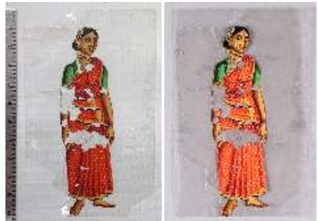
Fig. 9. Mica repairs and fills with Paraloid B-72 and BEVA 371 film. Painting 27.2. During (left) and after (right) treatment.

BEVA 371 film proved to be a fast, easy, and visually compatible repair material for filling losses and bridging simple breaks without overlapping mica (fig. 9). Sold in rolls, BEVA 371 film is a dried transparent layer of thermoplastic, elastomeric polymers sandwiched between protective outer layers of 4-mil silicone release paper and 1.5-mil Mylar (Berger 1975; Jamison et al 2010). The BEVA 371 film was custom-shaped with scissors to cover breaks and losses. The paper layer was peeled off and the repair was placed adhesive-side down on the verso and set in place with a heated tool at low heat (150°F). The heated tool was regulated with a rheostat