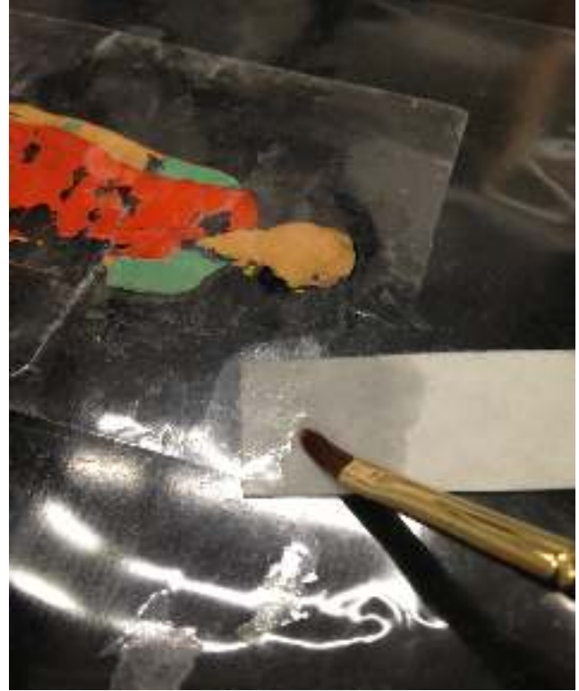
Fig. 8. Flushing out delaminated mica layers to prepare for Paraloid B-72 and BEVA 371 film repairs. Painting 5.2. During treatment.