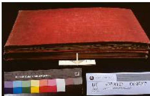
Fig. 1. Indian Coloured Drawings (270 x 415 x 35mm). Before treatment from tail. n.a., n.d. NYPL MAF++ ( Indian coloured drawings ).

Presented at the Book and Paper Group Session, AIC's 42nd Annual Meeting, May 27–31, 2014, San Francisco, California.