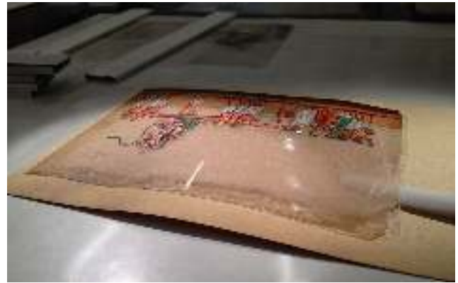
Fig. 5. Lined overall and edge-mounted to the album page, painting 16.1 was partially detached from the album page. During treatment.

suggesting the occurrence of earlier undocumented, but well-intentioned, “tidying.”