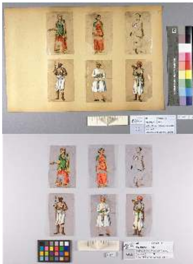
Fig. 2. Surface grime, paint loss, and mica damage. Page 27. During (top) and after (bottom) treatment.

The paintings were executed in gouache, opaque pigment-based watercolors with fillers of chalk or gypsum (Ash 1985; Hansen 1993). Layering techniques and color grounds