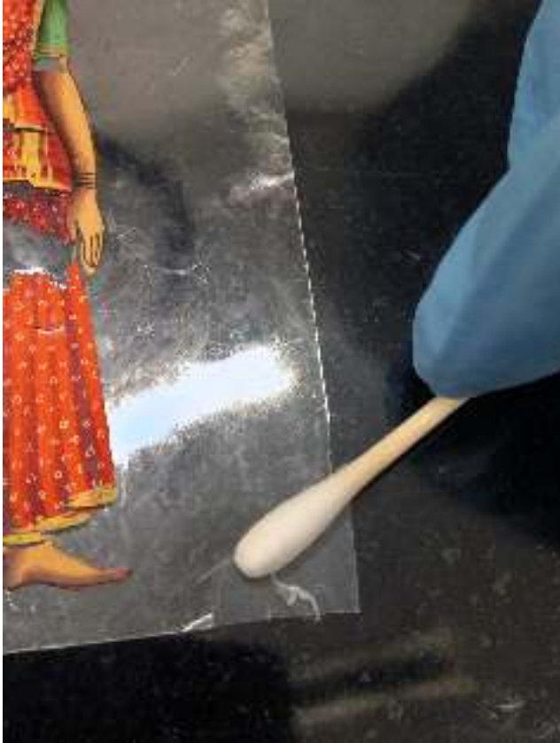
Fig. 10. Detail of BEVA 371 film fill at lower right corner recto. Painting 27.2. During treatment.

the silicone tipped sculpting tools (fig. 10). Adhesive remained only where the Mylar film layer overlapped with original mica.