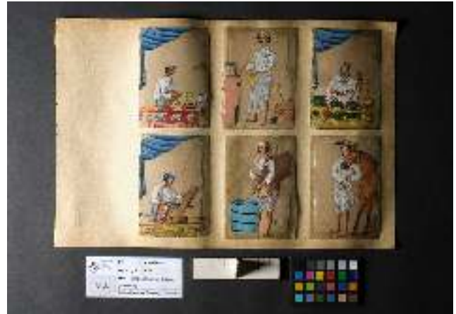
Fig. 4. Overall planar distortion, raking light. Page 18. During treatment.

The linings and edge-mounting proved to be ruinous. Humidity and temperature fluctuations in ambient storage conditions caused the paint on the recto and the paste/paper layers on the verso to expand and contract while the mica mineral support remained inert. Crowding on the page enhanced planar distortion of the paper album pages. The grain direction of the paper encouraged cockling along the vertical axis, bowing the micas (fig. 4). The layered crystalline structure of the mica easily cleaved in thin layers, resulting in complex breaks, shearing, and paint loss (fig. 5). Few loose paint or mica fragments were present in the album gutters,