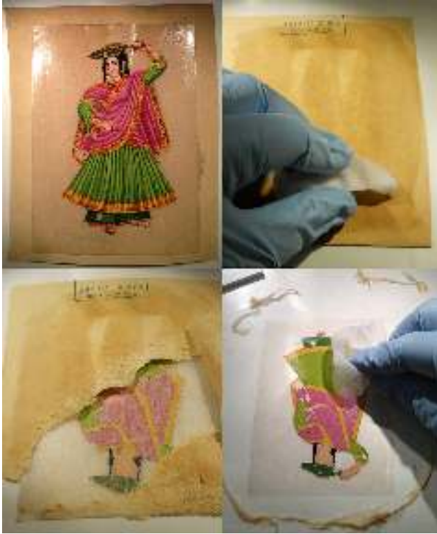
Fig. 7. Local humidification from the back to remove paper linings and adhesive residues. Painting 23.2. During treatment.