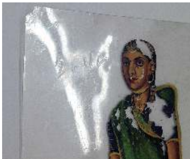
Fig. 3. Alphanumeric identifier “26UL” at top left corner in raking light. Painting 27.1. During treatment.