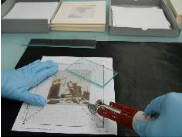
Fig. 11. Using a heated tool to activate Beva 371 film and attach treated mica painting to Mylar handling mount. Painting 4.2. During treatment.