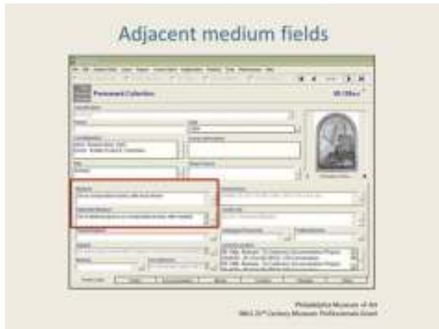
Fig. 2. Presentation slide showing adjacency of “Medium” and “Extended Medium” fields in a collections database.

while conveying maximum information. The descriptions follow the Guidelines for language and syntax and, ideally, come from direct visual examination.