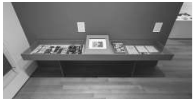
Fig. 8. Installation view of Wait, Later This Will Be Nothing: Editions by Dieter Roth , showing touch-screen monitor in gallery