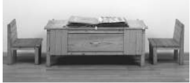
Fig. 1. Dieter Roth (Swiss, born Germany, 1930–1998). Snow . 1964/69. Artist's book of mixed mediums, with wood table and two wood chairs. The Museum of Modern Art, New York. Committee on Painting and Sculpture Funds. Courtesy of John Wronn, © 2013 Estate of Dieter Roth

Roth produced, by his estimate, 6000 drawings, prints, photographs, and notes over three months, working with an assistant provided by the college, and tacking "every piece of paper [he'd] touched during the day" onto the wall (Vischer