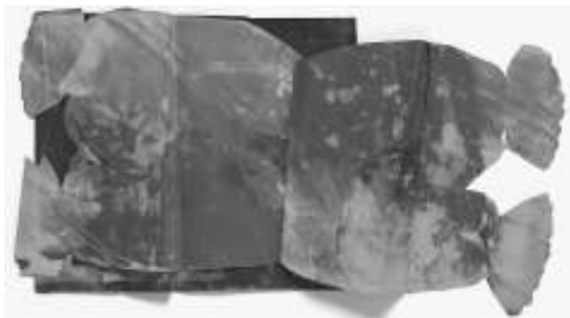
Fig. 4. Spread from Snow . 1964/69. Felt-tip pen on cut diazotype, 46.4 x 115.6 cm

were rubber based. Over time, these adhesives spread, discolor, and eventually lose their tack (Smith et al. 1983). This deteriorating adhesive is particularly harmful where tape was used to join the edges of the plastic sleeves—still-tacky adhesive has crept beyond the boundary of the tape carrier, causing the sleeves to stick together.