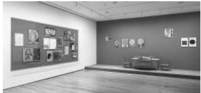
Fig. 7. Installation view of Wait, Later This Will Be Nothing: Editions by Dieter Roth . Shown: Dieter Roth. Snow . 1964/69. Artist's book of mixed mediums, with wood table and two wood chairs. The Museum of Modern Art. Committee on Painting and Sculpture Funds. © 2013 Estate of Dieter Roth

Snow represents a transitional moment in Roth's artistic career, after the constructivist books of his early years but before the chocolate sculptures and rotting food installations for which he later became famous. In devising a treatment plan, it was important to acknowledge and accept the changes that had taken place in the work, and to think about ways to improve its condition without attempting to return it to an "ideal" state that may never have been the artist's intention.