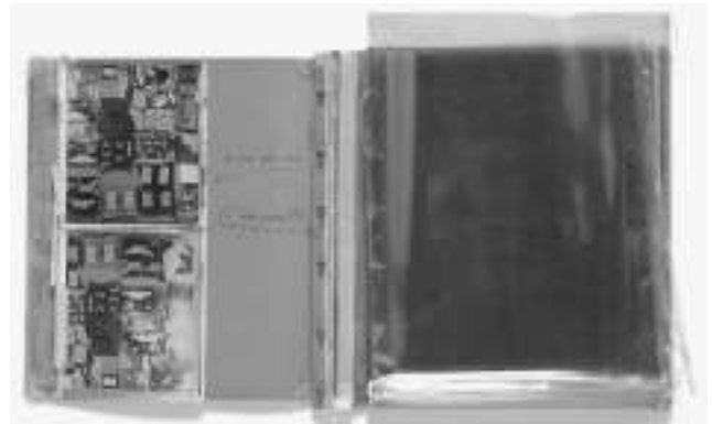
Fig. 6b. Spread from Snow as it exists today, showing PVC sleeves and partial binding structure. 1964/69. 50.8 x 89.5 cm.

gallery in 1969, in which visitors would be able to turn the pages of the album and access its many components. Reiser indicated that the new material was added solely to facilitate handling, and stated that Roth would not have felt that it was part of the work. Nevertheless, it altered the album in ways that could not be completely undone.