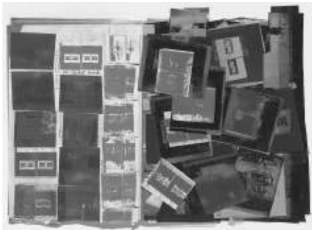
Fig. 3. Spread from Snow . 1964/69. Lithograph with offset mats and felt-tip pen, 44.5 x 58.4 cm