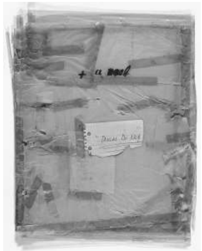
Fig. 5. Discolored tape on a tracing paper page from Snow . 1964/69. Tracing paper, notebook paper, tape and ink, 38.7 x 45.7 cm.

Transparentized or tracing papers, like those at the beginning of the album, are manufactured to be translucent. This translucency is achieved by a variety of methods, all of which weaken the paper (Hofmann et al. 1992). Due in large part to this inherent fragility, the tracing paper sections at the beginning of the album have become brittle and torn (fig. 5). In an apparent effort to provide support to the weak paper, each page was taped to a sheet of clear plastic film. FTIR analysis identified the plastic sheets as cellulose acetate, an unstable material that shrinks and distorts over time and