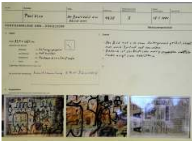
Fig. 12. Treatment report from 1992 describing what was felt to be damage to The Boulevard of the Abnormal Ones ( Der Boulevard der Abnormen ).

near-permanent periods of exhibition in the early days of the museum. The decision to allow permanent access to this body of works went in conjunction with the act of atonement ( Wiedergutmachung ) that was so vitally important for the founding of the museum. It was the wish of the politicians to show Klee's masterpieces permanently and prominently in the museum, for all the world to see. Hence, many of the works on paper have suffered severe light damage. The accumulation of hours of light exposure has led to fading of a few of the ink drawings in the collection. The mounts have also been affected. Often, a work's margins (where the secondary support was protected by a window mount) are lighter than the exposed image area. Discoloration has also appeared on mounts that were covered by acidic mats, which