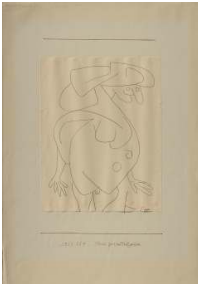
Fig. 9. Paul Klee, Venus Leaves and Withdraws ( Venus geht und tritt zurück ), 1939.679. Pencil on paper, mounted on cardboard, 50 x 35 cm. The work was adhered to the mount with dabs of adhesive placed in fairly regular intervals along the edges of the primary support.