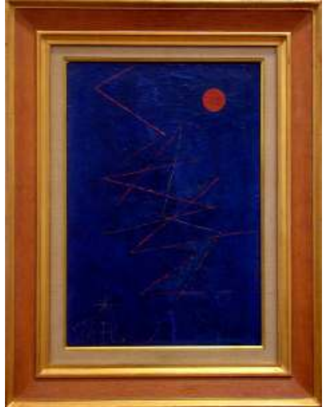
Fig. 5. Colorful Lightning (Bunter Blitz) in its ornate frame and liner, which cover up the strip-frame and hide the work's three-dimensional character.

level with the surface of the work, probably so that the work would fit snugly into its gilt frame (fig. 5). Klee, however, always mounted the strips to his panels in such a way that they protruded 5–10 mm from the surface of the work. 11