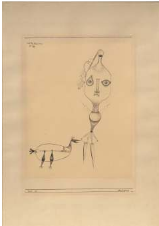
Fig. 8. Paul Klee, Glass Figures (Glasfiguren) , 1923.199. Pen and ink on paper, mounted on cardboard, 28.8 x 22.4 cm. The ink drawing was lined onto the mount, which developed slight horizontal buckles in the process.