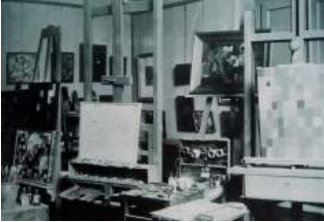
Fig. 2. Klee's studio at the Bauhaus in 1925. Photo by Paul Klee, courtesy of Archiv Zentrum Paul Klee

A number of works with their original presentation formats intact can also be studied at the Zentrum Paul Klee in Bern. There and at the Klee Estate, also in Bern, scholars have compiled a considerable amount of information concerning Klee's original frames and mounts. 7 Written proof of the artist's scrupulous attention to all aspects of the making and the presentation of his works can be found in Klee's diaries and letters and in the recollections of his contemporaries. His son Felix Klee remembered that his father "not only made paintings, he also prepared the colors himself, fabricated the frames and mounts and recorded every work, including measurements and technique, in his oeuvre catalogue." 8