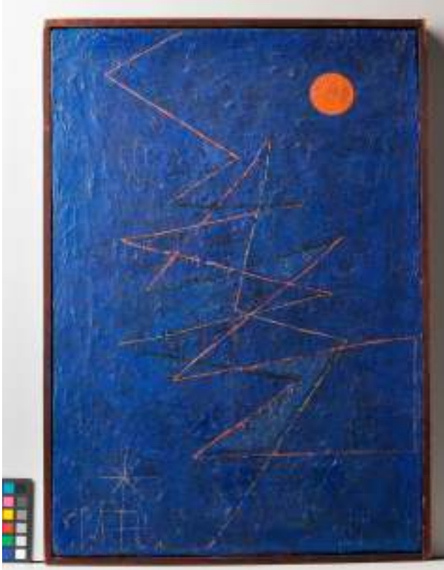
Fig. 4. Paul Klee, Colorful Lightning (Bunter Blitz) , 1927.181. Oil on canvas on cardboard on strainer with original strip-frame, 50.3 x 34.2 cm. The strip-frame is level with the surface of the work, a tell-tale sign that the strips have been taken off and reapplied by a third party.