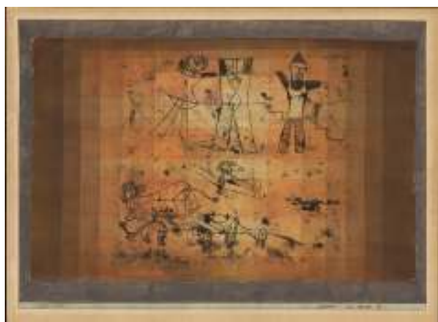
Fig. 10. Paul Klee, Lions, attention please! ( Loewen, man beachte sie! ), 1923.155. Oil transfer drawing, pencil, and watercolor on paper, bordered with watercolor and ink, mounted on cardboard, 30.5 x 48.5 cm. Klee decorated the mount with bands of watercolor, noting the title and date in the pale blue band below the image.

it seems obvious that the format of the primary support, rather than being forced to conform to a standardized format, appears to have been chosen so that the margins are in proportion to the dimensions of the work. Klee also often decorated the margins around a work. In these instances, the mount serves as an integral part of the design, as in the work Lions, attention please! ( Loewen, man beachte sie! ), 1923.155, which he chose to border with bands of watercolor (fig. 10).