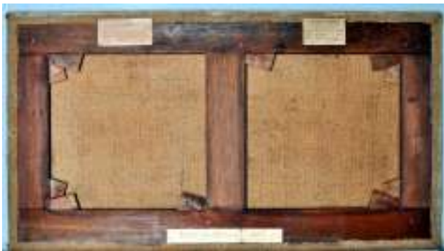
Fig. 14. Verso of Interval around Easter (Zwischenzeit gegen Ostern) with a fragment of the original mount bearing the title and the date attached to the lower bar of the stretcher.