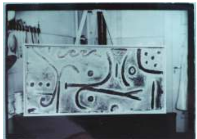
Fig. 3. Paul Klee, Dangerous ( Gefährliches ), 1938.124. Oil on cotton on cardboard on strainer, 27.5 x 58.5 cm. Archival photograph of the work in the studio in Bern, showing the work with an unpainted strip-frame attached to its edges.

However, one cannot help but feel the connection between a work's specific construction and Klee's choice of frame. For example, the surface appearance of the panel Colorful Lightning ( Bunter Blitz ), 1927.181, was achieved by a creating a structured, almost crusty ground into which the lines that form the image were incised. It has a certain mural character that is much enhanced by the stained strips of wood nailed to its sides, which are happily still in existence (fig. 4). Yet even in the instances in which the strip-frames have survived, slight modifications have often been made. In this case, the strips were taken off and re-applied so that they are