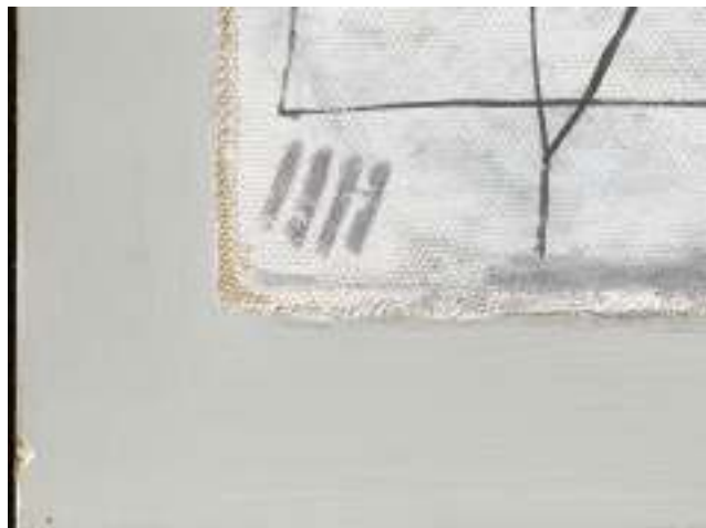
Fig. 18. Detail of Thoughts in the Snow ( Gedanken bei Schnee ) showing the original compound support embedded in the toned plaster substrate.

the work had been classified in Klee's oeuvre catalogue as a "multicolored sheet," indicating a work on paper. Finally, the archival photograph of the work showed the primary support mounted on cardstock, with the typical inscriptions along the bottom (fig. 15). Originally, the work must have been spot-adhered rather than lined to the cardstock mount, judging by the shadows that its edges are casting.