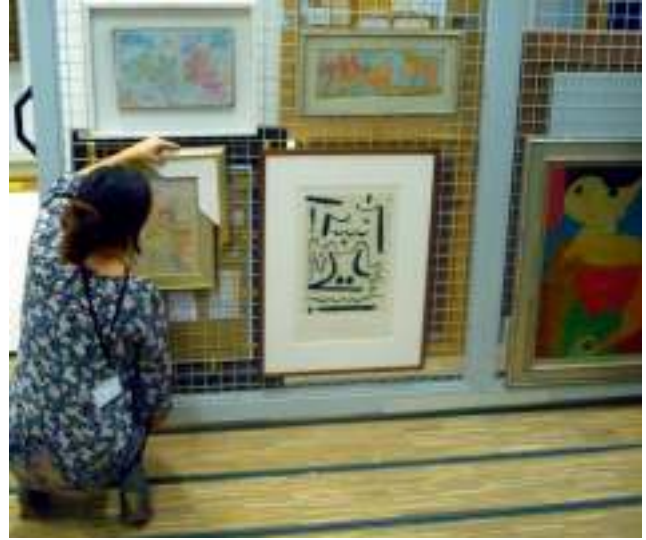
Fig. 20. Experimenting with the custom-made Bauhaus frame sample. Compared to the simple frame visible on the black-and-white drawing on the right, the frame sample seemed too interpretive.

The Kunstsammlung's Klee panels will not receive a single frame style. In acknowledgement of Klee's eclectic frame