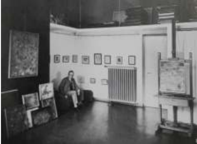
Fig. 19. Paul Klee in his Bauhaus studio in Dessau, 1927. The framed small-scale works on the studio walls are thought to be works on paper.

spent considerable time poring over various archival photographs and frame samples. The task of finding a single, appropriate frame style that would help balance Klee's highly individualized imagery and surfaces within a grouping—a task that was previously made more difficult by varying frame types—proved fairly grueling, as all frame samples supplied by Düsseldorf's major frame manufacturer felt simply wrong. Hence, experiments with a custom-made frame commenced. Modeled on a very simple Bauhaus-era frame with a triangular profile, the custom frame was aesthetically pleasing, but its gilt finish was off-putting. This too felt "historicizing," and even with a simple brown stain, the frame seemed too interpretive. In the end, it seemed that the more simple and less elaborate the frame, the better it allowed the subtleties of Klee's works on paper to speak for themselves (fig. 20). The museum settled on the frame that was already being used for the black-and-white drawings: a band-frame made from North American walnut (fig. 21). Its simple profile also seemed to mirror the unadorned wooden frames found in early photographs, which helped the decision along considerably.