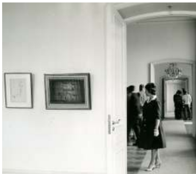
Fig. 1. Installation view of the 1961 inaugural exhibition held at the Kunstsammlung Nordrhein-Westfalen. To the left is the drawing Glass Figures (Glasfiguren) , 1937.214, which appears to be framed in a simple wooden frame. Lions, attention please! (Lowen, man beachte sie!) , 1923.155, a colored work on paper, appears in a more elaborate gilt frame.

The black-and-white drawings arrived in Düsseldorf in less elaborate frames, as a photograph from the Kunstsammlung's opening exhibition indicates (fig. 1). This specific group of works received new frames in 1999, after their presentation system was reevaluated by the new head of conservation and