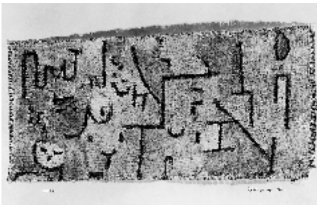
Fig. 15. Archival photograph of Interval around Easter (Zwischenzeit gegen Ostern) before it was altered.