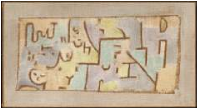
Fig. 13. Paul Klee, Interval around Easter (Zwischenzeit gegen Ostern) , 1938.342. Watercolor on chalk and paste ground on jute, mounted on canvas on stretcher (not by the artist), 29.7/32.5 x 66.5 cm.