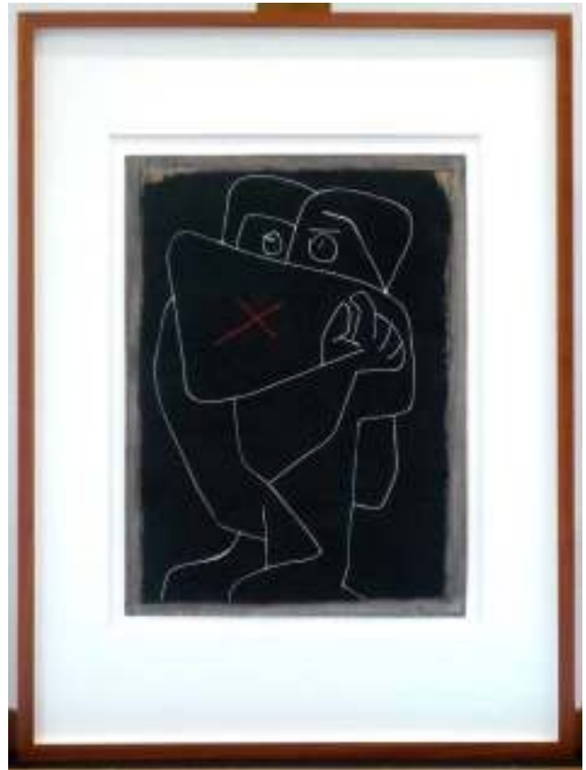
Fig. 21. Paul Klee, The Important Package (Das Wert-Paket) , 1939.858. Ink, pencil, and colored paste on paste ground on paper, mounted on cardboard (cardboard toned later, not by the artist), 45.5 x 32.7 cm. This 2011 mockup shows the work floated in the type of frame it will receive in 2012.