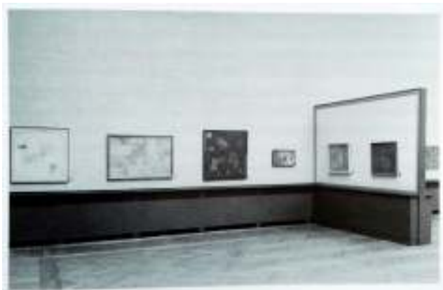
Fig. 7. Paul Klee Memorial Exhibition held at the Kunsthalle Basel in 1941. Works in strip-frames are shown next to works in other types of frames.