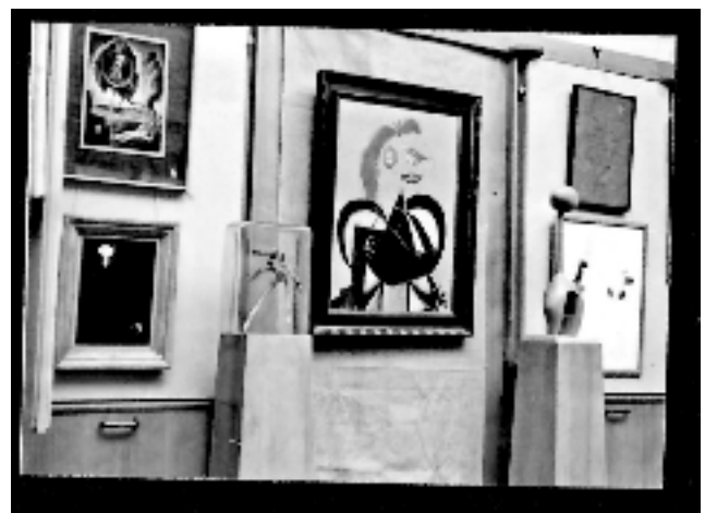
Fig. 6. Exhibition of Surrealism , Cambridge University Arts Society, 3–20 November 1937. Colorful Lightning is visible at the top right, presented just in its strip-frame. Roland Penrose, Penrose's Scrapbook , 1936–1937, Scottish National Gallery of Modern Art, p. 36

Today, works that have retained their strip-frames are often presented in simple box frames that allow the viewer to appreciate the three-dimensional character of these works while providing the necessary level of protection. However, it is important to be aware that strip-framed works were actually intended to go up on the wall just as they were, as can be seen in an early installation shot that shows Colorful Lightning in the Surrealist Exhibition organized by Roland Penrose at the Cambridge University Arts Society in 1937 (fig. 6). In this image, the work is mounted on the wall in its strip-frame, amidst works by other artists in ornate frames. After the artist's death, in the Paul Klee Memorial Exhibition at Kunsthalle Basel in 1941, works in strip-frames were also hung amidst works in other types of frames (fig. 7). This seems to indicate that in exhibitions that were prepared while Klee was alive, or that took place where his influence or that of his family prevailed, the strip-frames were regarded as complete presentation formats.