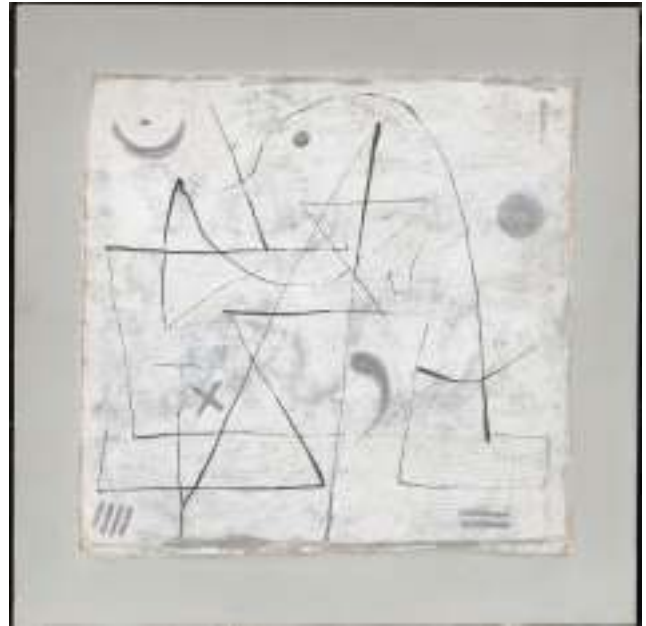
Fig. 16. Paul Klee, Thoughts in the Snow (Gedanken bei Schnee) , 1933.32. Watercolor on plaster ground on tulle on cardboard, mounted on plaster-coated Masonite (not by the artist), 45.5 x 46.5 cm. The work appears in its current presentation format, mounted onto a plaster-coated sheet of Masonite.