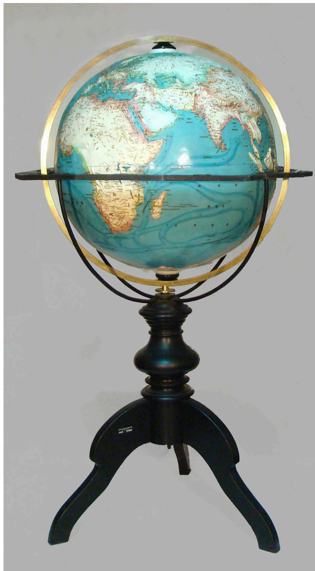
Fig. 12. The globe after treatment

Some cleaning was carried out on these metallic elements, focusing on the elimination of corrosion on the bronze elements. This cleaning was not very deep, given the instability of the painted metal. After the metal had been brought into