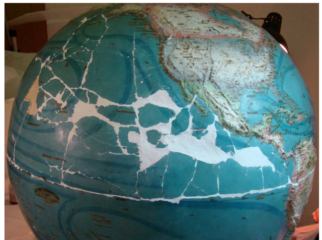
Fig. 10. Detail, filling losses

A final layer of ketone resin dissolved in white spirit was used to varnish and protect the retouched areas of the globe. Regrettably, two years after the treatment, there has been a slight darkening of these areas. This is attributed to the quality of the varnish and the ketone resin, which is softer than