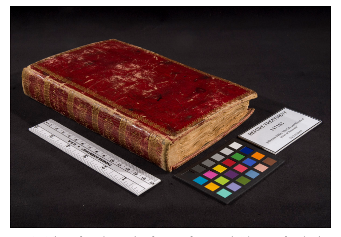
Fig. 1. "The Life and Morals of Jesus of Nazareth," known familiarly as "The Jefferson Bible," before treatment

Presented at the Book and Paper Group Session, AIC's 40th Annual Meeting, May 8–11, 2012, Albuquerque, New Mexico.