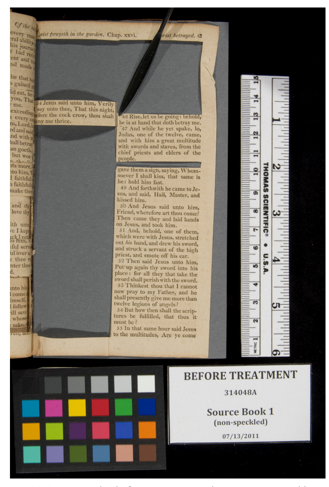
Fig. 11. Source Book 1 before treatment, with passages extracted by Jefferson

Both volumes were split through the text block, spine linings, and leather. Source Book 1 was broken twice. Source Book 2 was broken in three places. The curator suspected that these splits might have been created by Jefferson himself to aid in extracting clippings. If this was the case, or even a possibility, he did not want the breaks in the binding repaired.