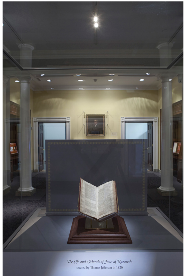
Fig. 13. "The Life and Morals of Jesus of Nazareth" on display at the National Museum of American History

By April 2012, the Jefferson Bible had generated 64 online articles, including international news stories, eight printed