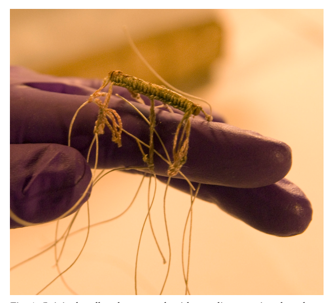
Fig. 4. Original endbands removed, with new linen sewing thread attached to each side of the tie-down

The folios were opened to the center, the sewing thread was cut, and the text block was separated into the original 43 folios. Because all the folios showed significant planar