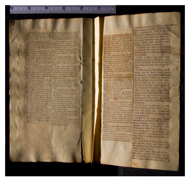
Fig. 5. Page spread of 7 verso and 8 recto in raking light during treatment. Note the adhered stub, the resulting damage, and Jefferson's dog-eared page corners.

distortion, the protective enclosures designed for them were sink mats, so there would be no danger of crushing them when the enclosures were stacked for storage in the vault every night. Each folio was opened and photographed before treatment in raking and ambient illumination (fig. 5).