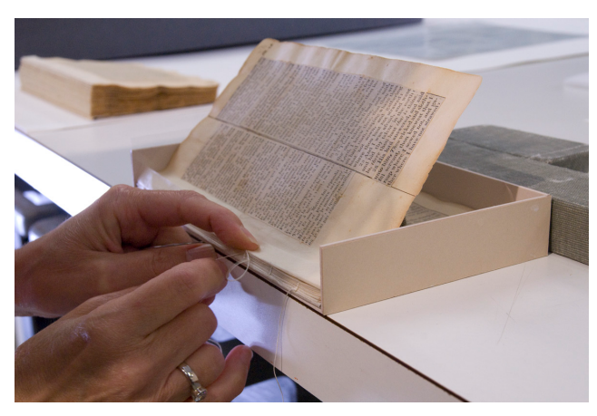
Fig. 7. Resewing the text block using a sewing tray made to the exact height of the desired thickness of the text block to align and protect page edges

Digital photography using a 50-megapixel Hasselblad camera proceeded in batches as folio mending was completed. These images were carefully examined for quality control.