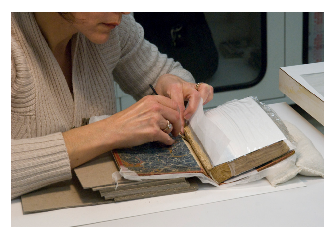
Fig. 3. Removing the leather binding intact

Methyl cellulose was applied to the spine of the text block to help soften and remove the remaining adhesive. Dental tools were used to gently scrape off the remnants of Mayo's lining paper. With the spine cleaned, the silk endbands were