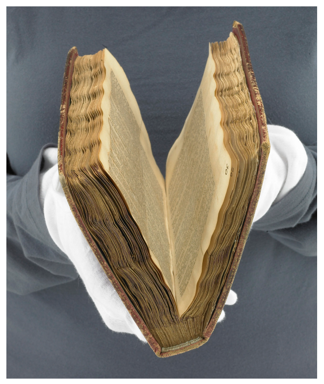
Fig. 2. Restricted opening of the Jefferson Bible. Note in particular the way the leaves hinge near the stubs, causing cracks and tears.

The curators recognized that Jefferson's book was actually two masterpieces—Mayo's binding and Jefferson's Bible—but of the two, Jefferson's work was more important to the museum. Since the binding was clearly damaging the Jefferson document within, Mayo's work would have