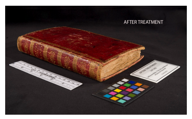
Fig. 8. "The Life and Morals of Jesus of Nazareth" after treatment

After lining, the sewn book was opened and paged through several times to observe how the pages moved and determine where additional page repairs or support were needed. The marbled pastedowns were lifted from the front and back cover boards using ethanol, methyl cellulose, and a Teflon lifter. The leather spine was supported from the inside with layers of Japanese paper, with the uppermost layer toned blue to assist future conservators. To recreate the tight-back structure, the text block was adhered to the covers using wheat-starch paste on the spine, the exposed boards, and the lining tabs, which were adhered beneath the marbled papers. About 1/8 in. of each tab was visible inside the hinges. The exposed tabs were inpainted with dots of Golden Fluid Acrylic Paints to match the Stormont marbled paper. After the treatment was complete, the Jefferson Bible maintained its original aesthetic (figs. 8–10).