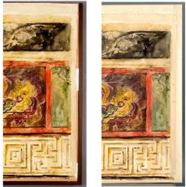
Fig. 3. Left, before treatment with T-hinges mounted to Gatorboard. Right, after treatment with toned strip hinges attached to aluminum honeycomb panels

As was noted in the treatment section, BEVA film was used to both attach the hinges to the watercolors as well as to the exposed poplar on the backs of the panels. After the watercolors had been measured, custom strips of BEVA film were cut