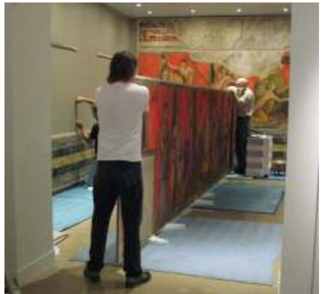
Fig. 6. Installation of the twenty foot panels in the Barosso Gallery