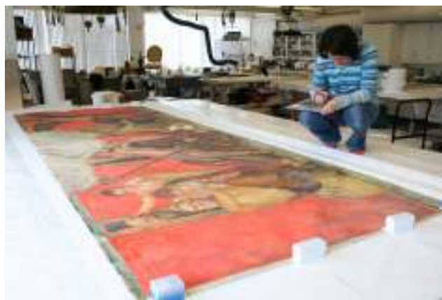
Fig. 1. Creation of annotated photographs for the condition binder

Once the treatment protocol had been established for humidification and flattening, it became clear that the joined