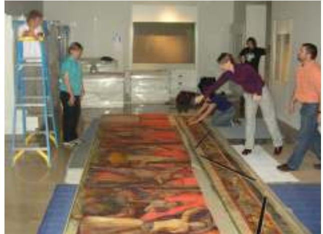
Fig. 4. Aligning the twenty foot watercolors on the floor in the Kelsey Museum galleries

While some members of the team mounted the larger panels, the smaller panels that had already been mounted at the ICA could be installed by the remainder of the team. A simple wooden cleat system was used to attach the watercolors to the wall, and an eighth inch gap was left between the