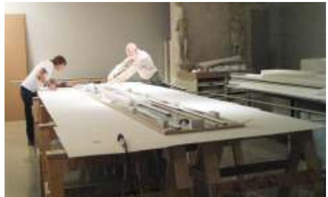
Fig. 5. Mounting one of the sixteen foot watercolors to an aluminum honeycomb panel in the Kelsey Museum galleries