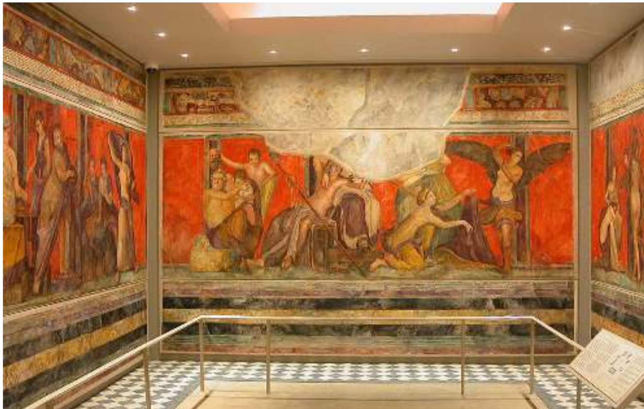
Fig. 7. The Barosso Gallery at the Kelsey Museum of Archaeology

panels in each set so they would not be resting directly on each other (fig. 6). This meant that the panels had to be installed from the bottom up and there needed to be enough room left at the top to lift the last panel up and over the cleat without bumping into the ceiling. The cleat system also allowed for the smaller watercolors to be easily removed from the wall and the tension adjusted where necessary.