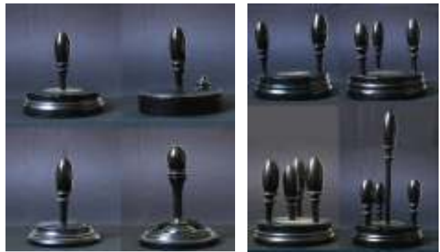
Figs. 8a–b. Single model bases (left) and two- to four-knobbed model bases (right)

Each model is glued to a vertical or bowed rattan rod which easily fits into a knob mounted on wooden base, both well-turned and polished in black lacquer. There are bases with one, two, three, or four knobs, depending on the