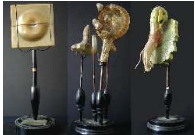
Fig. 18. Gelatin-based models: Pteris serrulata L. (four pieces), Pteridopsida. R. Brendel, Berlin, no. 6, and Aspidium filix-mas Sw., Pteridopsida. R. Brendel, Berlin, no. 8