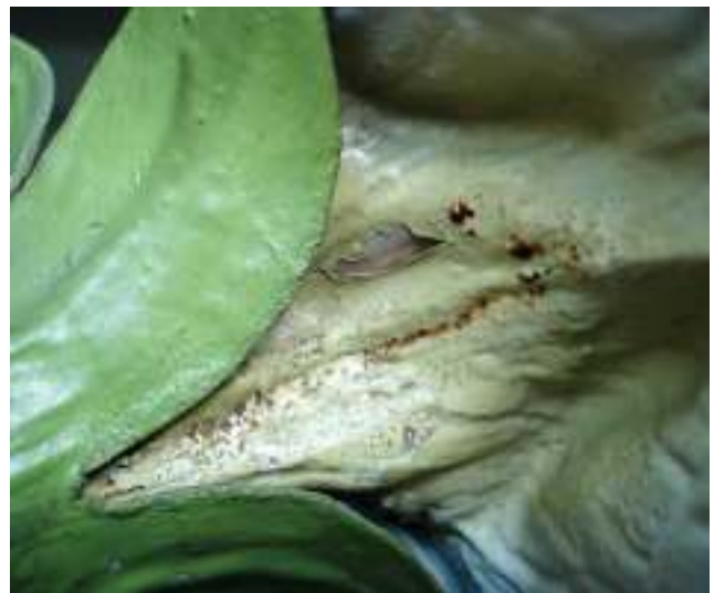
Fig. 25. Flaking color

For secure, effective, and controllable surface cleaning, a system using small cotton swabs dipped in 2% solution of oxgall was selected. This surfactant allowed for cleaning the polychrome surface. The areas with flaking color (fig. 25)