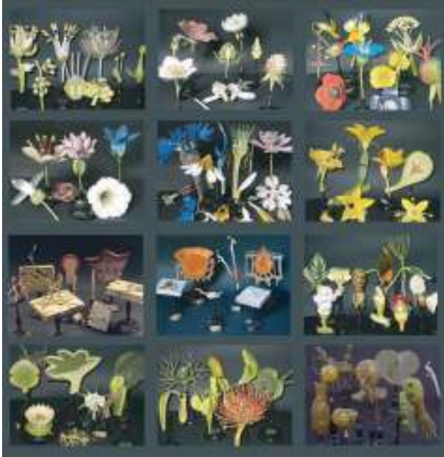
Fig. 1. University of Florence Brendel models

not only lifelike anatomical structures, but, with the introduction of the microscope, creating enlarged versions of the “unseen” world as well. The famous Florentine waxworks (established for the traditional manufacture of Christian