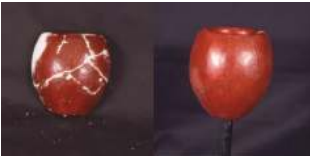
Fig. 34. Detail of figure 33

Reiling, H., and T. Spunarová. 2005. Václav Frič (1839–1916) and his influence on collecting natural history. Journal of the History of Collections 17: 23–43.