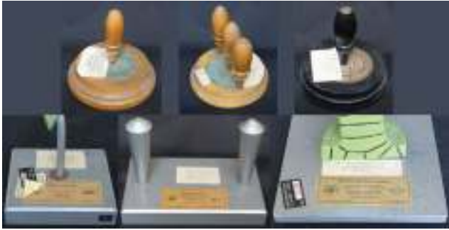
Fig. 7. Different Brendel model bases

museum, and several high schools, and there are Brendel collections to be found in Europe, the United States, and Australia. Whilst the same quality and craftsmanship shows through on each model, there are minor differences in color, size, and detail that can be noted, including changing styles of the base units (fig. 7).