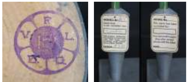
Figs. 6–6c. PhyWe's model stand (top) with their label (middle) and "RB" logo (bottom, left), and 1963 tags (bottom, right)