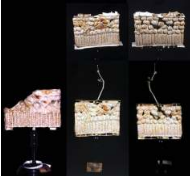
Fig. 23. Phases during treatment. Peronospora viticola —Eumycetophyta, Oomycetales. R. Brendel, Berlin, no. 5

To proceed in a systematic and orderly manner, all of the models were numbered, photographed, and filed individually,