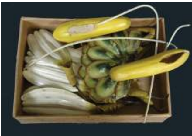
Fig. 21. Damaged fragments

Almost all the bases evidenced woodworm holes and traces of xylophagous insects.