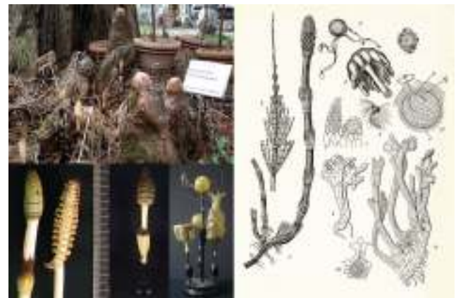
Fig. 22. Horsetail "in bloom" at the Giardino dei Semplici (top picture); two live samples of strobilius and sporangiophores (6 cm) and Brendel model (60 cm) Equisetum arvense L.-Sphaenopsida. R. Brendel, Berlin, no. 2. Gelatin models of the horsetail's microscopic phases; Equisetum arvense L. (20–100x) (four pieces), Sphaenopsida. R. Brendel, Berlin, no. 3; Equisetum arvense illustration in Tonzig, S., Elementi di Botanica

Whenever the conservators were faced with undecipherable fragments and there were no duplicate models on hand, the scientist's botanical expertise, supplemented as