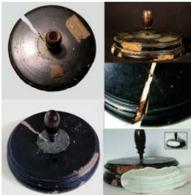
Fig. 24. Treatment of base

and then divided in groups according to dimension, materials, and types of damage that required treatment.