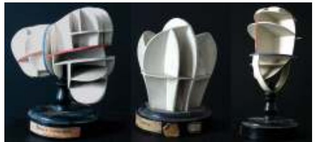
Fig. 15. Salvinia natans embryo model–R. Brendel, Berlin, unlabeled, (ex R. Ist. Sup. Femm. FI, no. 87–2), Anteridio (cellular division) R. Brendel, Berlin, no. 81(1); Pellia epiphylla embryo model, R. Brendel, Berlin, no. 74 (1)

number of plant elements represented (figs. 8a–b); others have the models directly attached. A circular or rectangular paper label identifies the model and is glued or affixed to the base with small brass nails. Some bases also have smaller slit knobs where labels were once exhibited. The circular labels on the bases are very detailed: there is the Latin nomenclature, the generic common name in German, the series number, the magnification of the object printed in black ink on green card, and the company name, R. Brendel Berlin (figs. 9–10). Earlier models seem to be written only in German whereas the later model generic names are also written in English, French, and Italian.