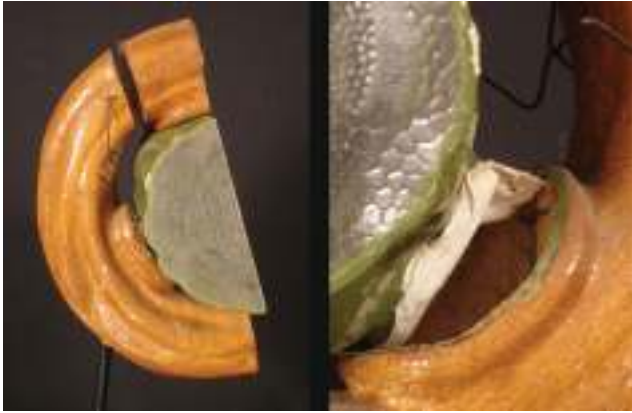
Fig. 11. Cuscuta trifolii Bab.–R. Brendel, Berlin, no. 108