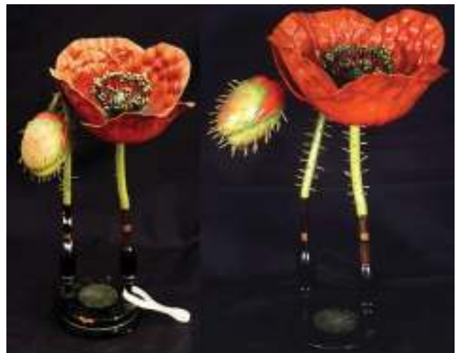
Fig. 28. Papaver rhoeas L. (two pieces), Papaveraceae. R. Brendel, Berlin, no. 87

The packaging phase of the restored models was just as important and as indispensable for safely transporting the models back to the University's Department of Botany. It was fascinating to learn that in 1826, French model maker Louis Marc Antoine Robillard d'Argenteille, returned to Paris aboard the William Wallace from Mauritius, where