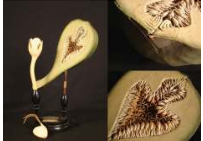
Fig. 14. Ficus carica L. (two pieces), Urticaceae. R. Brendel, Berlin, no. 136 (ex R. Ist. Sup. Femm. FI)