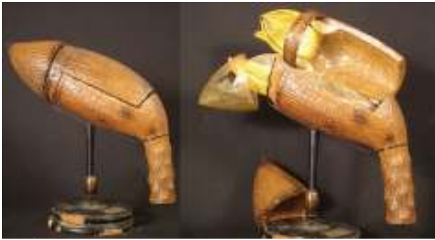
Fig. 2. Model enlarged 1500x. Brachytecium acetabulum Br. (six pieces), Bryopsida. R. Brendel, Berlin, no. 1