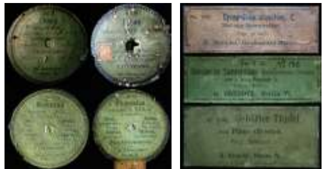
Figs. 9–10. Circular and rectangular Brendel model labels