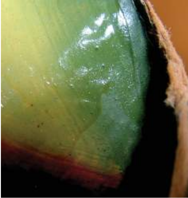
Fig. 16. Shellac over painted surface, detail Calatide (two pieces), R. Brendel, Berlin, no. 170b

Other shapes and models are in plaster and all details are painted by hand. The color used is pigment in a water-based medium, protected by a shellac varnish (fig. 16).