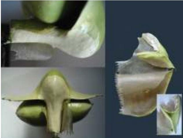
Fig. 19. Damaged sepal in gelatin with delaminated paint. Lycopodium clavatum L., Lycopsidea. R. Brendel, Berlin, no. 193