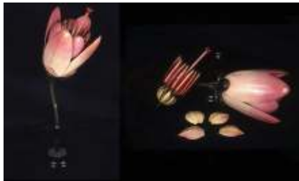
LEFT TO RIGHT Fig. 3. Fumaria officinalis L. (four pieces), Fumariaceae. R. Brendel, Berlin, no. 89