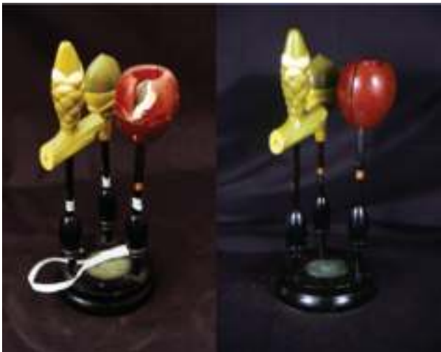
Fig. 33. Taxus baccata L. (f) (three pieces), Pinophyta, Taxaceae. R. Brendel, Berlin, no. 40