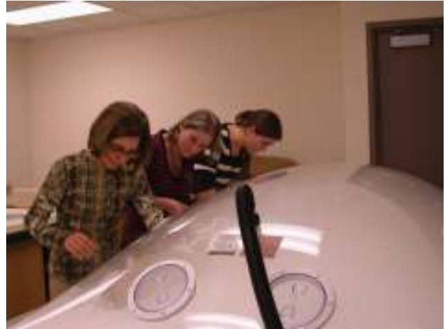
Fig. 5. The consultants and project conservator examine a map in the humidity chamber

A detailed survey of the maps’ condition also required identifying the types of damage that were common among the maps. It was found the main factors of deterioration were threefold: inherent vices in the materials used to construct the maps; the environment of the coal mines in which the maps were used; and the manner in which the maps were utilized, repaired, and stored. The combination of rolled storage and brittle paper resulted in a fragile map that users had to “crack” open in order to read, causing tears, regular patterns of creasing, and areas of loss (fig. 7). These damages were often