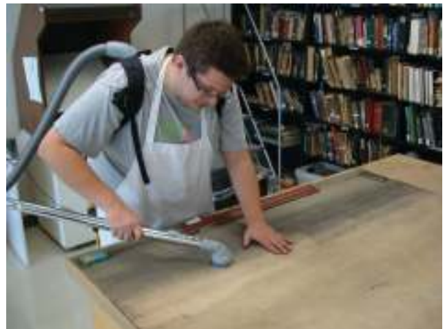
Fig. 9. A student assistant vacuums the back of a map with the Nilfisk back vacuum using the dust brush attachment

The staff cleans the canvas backing of maps using a Nilfisk back vacuum with hypo-allergenic dust brush attachment (fig. 9). A clothes brush attachment with short stiff bristles was tested for cleaning, but this attachment was not as effective at cleaning deep into the canvas weave as the soft long bristles of the dust brush. The vacuum is not used on the front of maps as the paper is too fragile to withstand even gentle suction and there is also friable media present on every map. A fellow conservator suggested holding the vacuum cone slightly above the paper, but this only removed a small amount of soot. The sponges are more effective at cleaning the front of the maps.