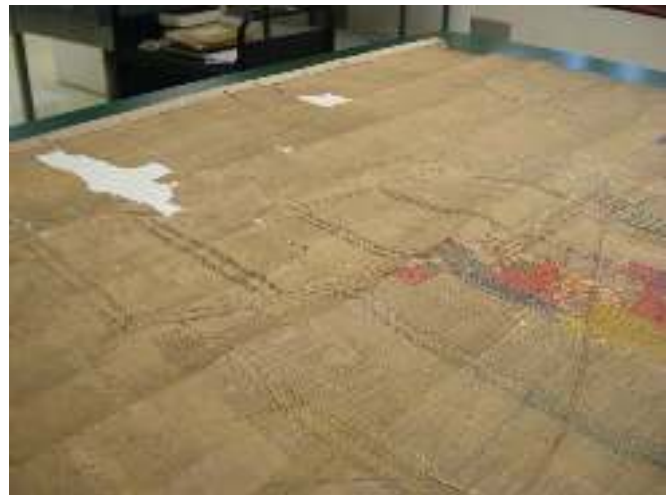
Figs. 12–13. Front of map before mending (left). Front of map after mending showing white muslin patches (right)