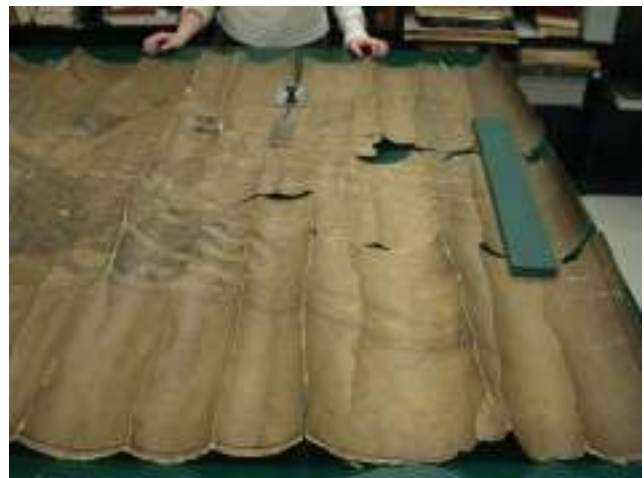
Fig. 7. A hardback map showing tears, losses, and a regular pattern of creases

repaired with pressure-sensitive tapes or patches of canvas. Because the maps were heavily used inside working mines, a considerable amount of coal dust has accumulated on the