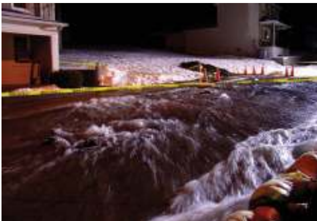
Fig. 3. Mine water breakout in McDonald, Pennsylvania, in 2005

The maps are also an important source of information for municipal, economic, and transportation planners as they seek to develop new housing, commercial facilities, and highways, as well as deal with such issues as subsidence and mine water runoff. In recent years, these hardbacks have been consulted by a variety of people, including: a private citizens group undertaking a land reclamation project dealing with the underlying mines and mine drainage issues to convert 452 acres in the southwestern corner of Settler's Cabin Park in North Fayette and Collier Townships into the Botanic Garden of Western Pennsylvania; engineers planning the route of the Mon-Fayette Expressway, a key to future economic development in the Monongahela and Youghiogheny