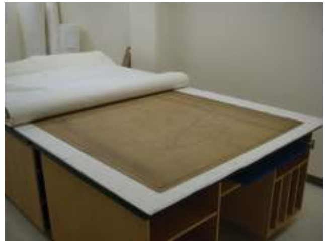
Fig. 11. Map between polyester webbing and felt after humidification and flattening