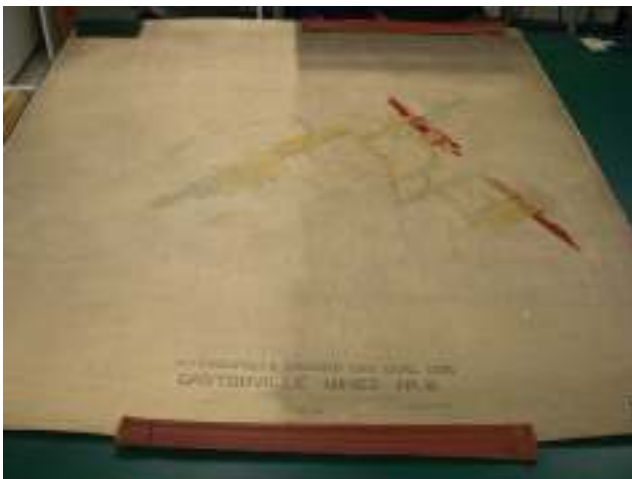
Fig. 8. The left side of this map was cleaned with soot sponges. The right half of the map shows the original amount of coal dust present

The project conservator and consultants tested methods for dry cleaning including Absorbene putty, dust cloths, eraser crumbs, soot sponges, Wishab sponges, and Magic Rub erasers. Soot sponges and Wishab sponges removed the most soot and cleaned the largest areas on the front of the maps (fig. 8). The smaller 3 x 6 x 3/4" soot sponges that are available in many archival products catalogs were originally used, but they proved difficult to grasp and the staff often had to fold these in half to get a better grip. It took two of these sponges to clean one map on average. Switching to larger 3 x 9 x 1 1/4" soot sponges and ordering them directly from the manufacturer made cleaning more efficient and reduced cost by ninety-five percent. The larger sponges are easier to hold and can be reused by trimming dirty areas with scissors. On average one large sponge will effectively surface clean up to three maps. Student assistants perform much of the dry cleaning