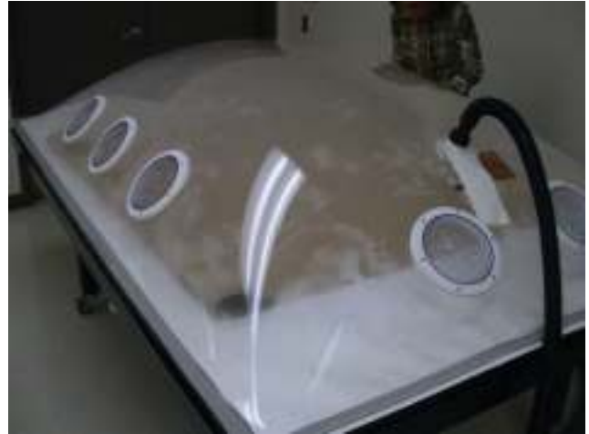
Fig. 10. Map during humidification

The project staff creates cores made of blotter as a temporary support to transport the maps around the lab. In order to protect the treated maps when they are sent to the scanning facility each month they are wrapped in a "raincoat" of four-millimeter polyester tubing. The tubing is cut down to the