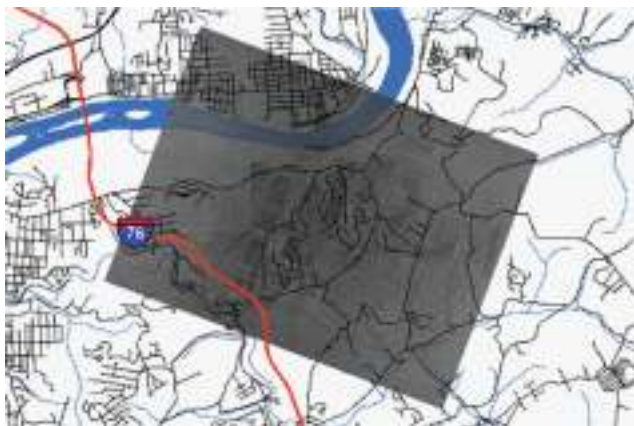
Fig. 15. Detail of a digitized hardback map geo-referenced to a road map also showing physical rivers and creeks

At the NMMR the maps are cataloged into their own database. The maps are digitized on a Cruse Table Scanner CS 285/1100 ST/FA. The scanner is equipped with a 58" x 90" vacuum table. The maps are scanned in 24-bit true color at 200–250 dots per inch, captured with an optical lens camera. The images are stored as uncompressed, tagged image file format (TIFF) files and the average size is 1.1 gigabytes per image. After the physical maps have been scanned the TIFF images are saved to an external hard drive and transported to the PA-DEP where the digital data is cataloged and geo-referenced by mining specialists.