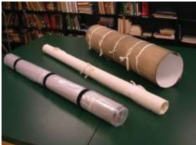
Fig. 14. From left to right: map wrapped in poly tubing, secured with Velcro for transportation to the scanning facility; map wrapped in muslin with cloth ties for final storage; and map wrapped on blottor core and secured with cloth ties for temporary support

The project staff determined that the maps had to be transported to the scanning facility, but then be able to lay flat on the scanner bed. Maps that could not lay flat on their own had to be able to withstand the suction generated from the scanning bed in order to keep them even and level. A mining specialist from PA-DEP picks up an average of ten to fifteen maps each month to transport them to the NMMR for scanning and returns the original maps to the University of Pittsburgh for long-term storage. The various physical locations of the maps are tracked through the CONcat database.