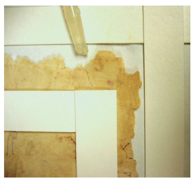
Fig. 2. Using a dropper to apply pulp.