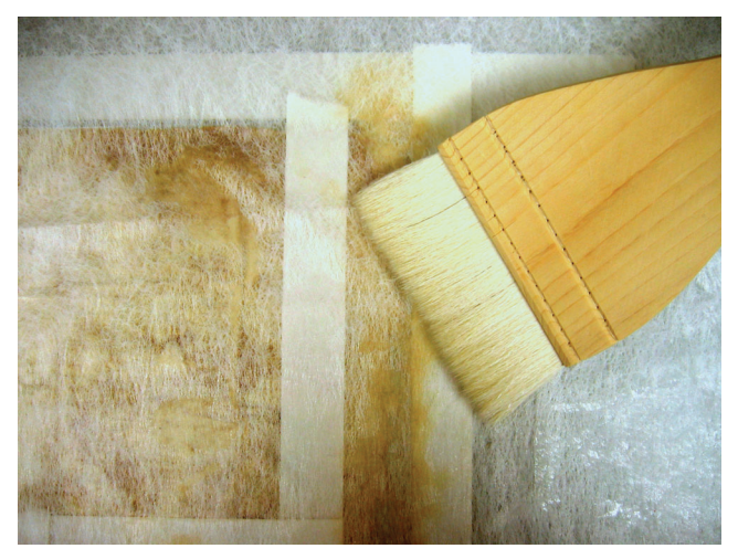
Fig. 4. Applying dilute methyl cellulose with a hake brush.

Minimal equipment was required to carry out this project, no more than a blender for mixing pulp and the suction table for the pulp filling process. A few basic supplies were required: pulp, thin blotter for use on the suction table, thicker blotter for masking the fill area, a water sprayer, a dropper and/or small beakers for pulp application, a Te flon folder or roller for smoothing the pulp after filling, spun polyester sheets, and a Japanese hake (sizing) brush.