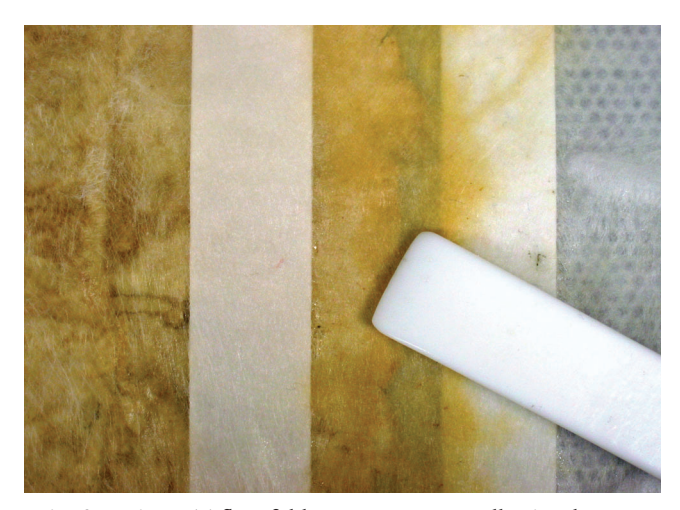
Fig. 3. Using a Teflon folder to encourage adhesion between pulp and paper.