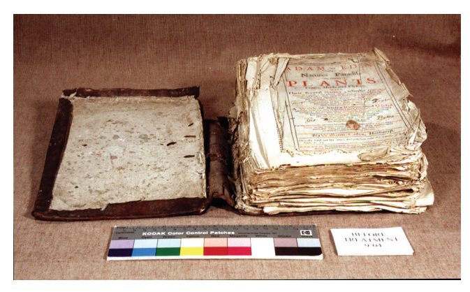
Fig. 1. Book before treatment: William Coles, Adam in Eden, or, Natures Paradise . . ., London, 1657.

Pulp may be made from pure cotton linters, paper pulp, or reconstituted conservation-quality papers. The last approach was used in this case study. A combination of four papers provided the best match. In order to determine the best color and textural match, test squares were made from different combinations of paper.