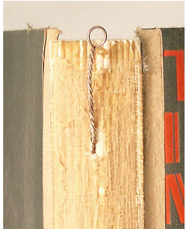
Fig. 3. Ten Years in Soviet Moscow . Exterior side view of the wire loop.