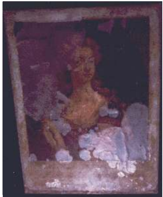
Fig. 7. Raking light photography shows clearly the where the vanish layer has failed and left air pockets between the surfaces of the paper support and the glass.

Eagle II Micro-EDXRF (Rh tube) instrument on a sample of the support. He found that the sample contained chlorine (fig. 6). The source of the chlorine is unknown.