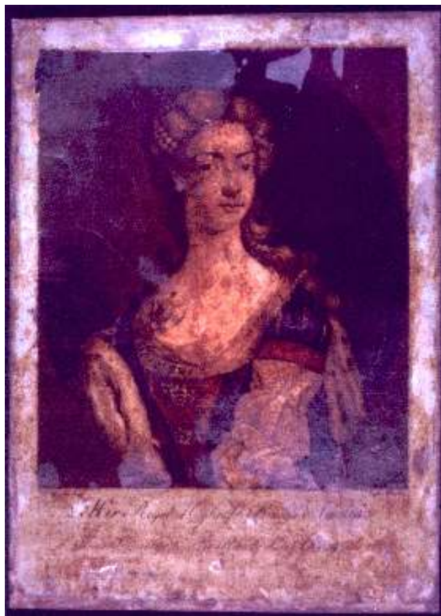
Fig. 3. Her Royal Highness Princess Amelia , Faber after Hysing, [18th century], Princeton University Library, no accession number.

hair is ornamented with large pearls and she appears to be wrapped in an ermine cape around her shoulders. The print has been in-painted with a vibrant red and dark brown color for the clothing. It is difficult to discern the colors used in the hair and face other than the light red employed for the lips because of the brown staining and discoloration that is present. The print is strikingly similar to a print of the same title by John Faber the Younger about the same time. The latter print shows the same head, shoulders and garments of the Princess Amelia, but with a fuller view of the body down to the waist.