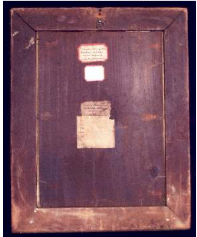
Fig. 2. The Sleepy Congregation . The verso of the frame has been left undisturbed. Newspapers were folded and stuffed between the glass print and a wooden back board that is held in place with large iron nails.

This case study concerns a glass print by John Faber the Younger (1695-1756) and is entitled Her Royal Highness Princess Amelia , which is in the Graphic Arts Collection of