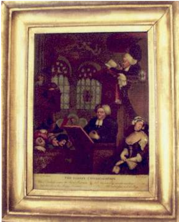
Fig. 1. The Sleepy Congregation , Corbet after Hogarth, [18th century], Princeton University Library, no accession number. A very beautiful and interesting glass print with a very lustrous gilded frame.

goal was trying to enhance the painterly characteristics of the object. Lush carving and gilding also adorned the frames.