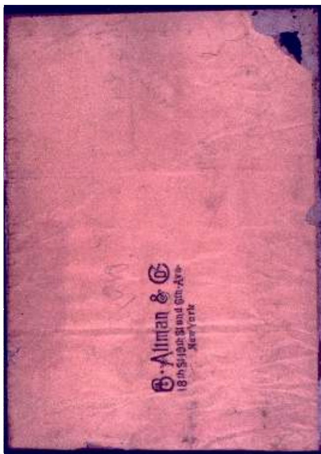
Fig. 4. Brown kraft paper with a stamped label, "B. Altman & Co." B. Altman & Co. was a retail household goods store founded by Benjamin Altman in New York City, New York. The small original store moved to a much larger site on Sixth Avenue at Nineteenth Street in 1876 where it remained until 1906, when it moved again to an even larger site on Fifth Avenue between Thirty-fourth and Thirty-fifth Streets (B. Altman & Co. 1914, Introduction). Among the home furnishings and items that the store sold was artwork.

The glass portion of the object is 37 cm high by 26.5 cm wide by 2 mm thick. It has a slight green tinge and an uneven surface, which suggests that it is the original crown glass. The print, which covers the glass completely, is attached with an adhesive. The adhesive has a yellow-orange fluorescence under long wave ultraviolet illumination, suggests that it may be varnish. The paper support was reduced to a wafer-thin thickness. It is not known whether the mezzotinter applied the print to the glass and in-painted it. At some period in the late nineteenth century or early twentieth century a sheet of brown