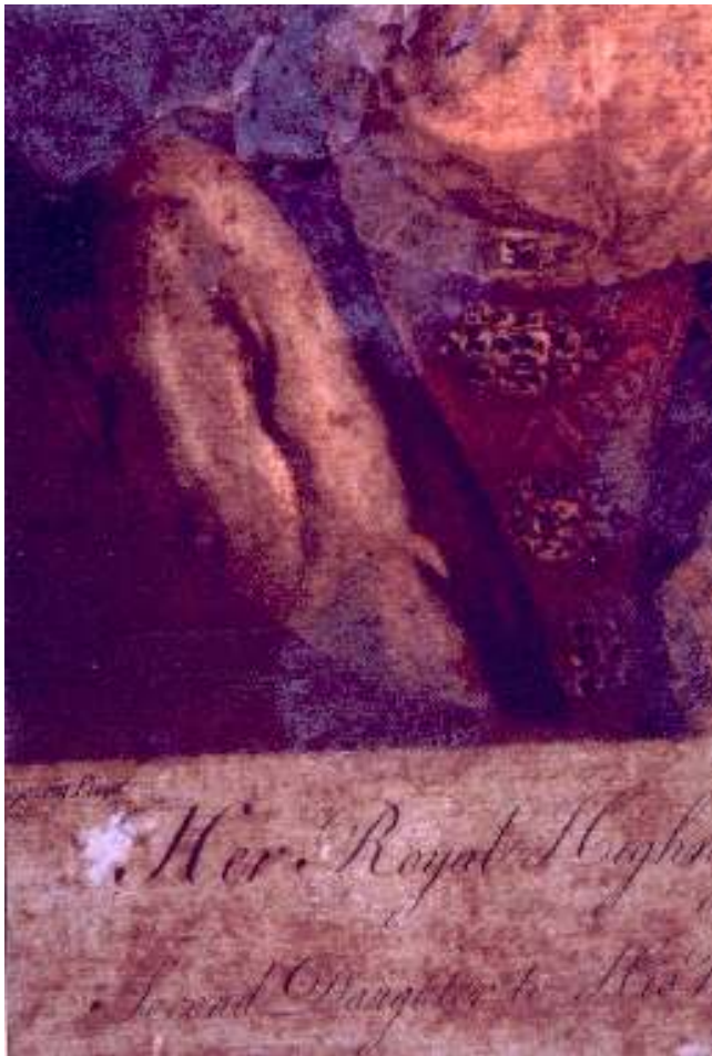
Fig. 5. A close-up view of a badly stained area, which is typical of most of the print.