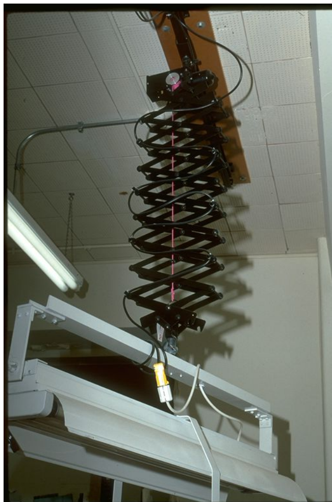
Fig. 4. An extensible support for lighting fixtures.

1. The address of the vendor from whom we purchased our bulb and reflector is as follows: Worm's Way, 7850 North Highway 37, Bloomington, Indiana 47404. Call for other locations or a catalogue: (800) 316-1264. The metal halide bulb and housing discussed in this article were ordered from Worm's Way, cat. no. MHAL100, for the "Super Grow Wing" reflector, with 1000 Watt bulb and glass safety lens.