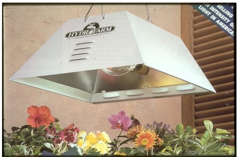
Fig. 1. Typical installation of a metal halide lamp fixture in an agricultural setting.

Designers of artificial lights for greenhouse gardeners have long tried to produce a bulb with less output in the yellow and red end of the spectrum but with more output in the blue end, which would help promote normal growth patterns for plants. The spectral power distribution of a typical metal halide bulb shows a substantial spike