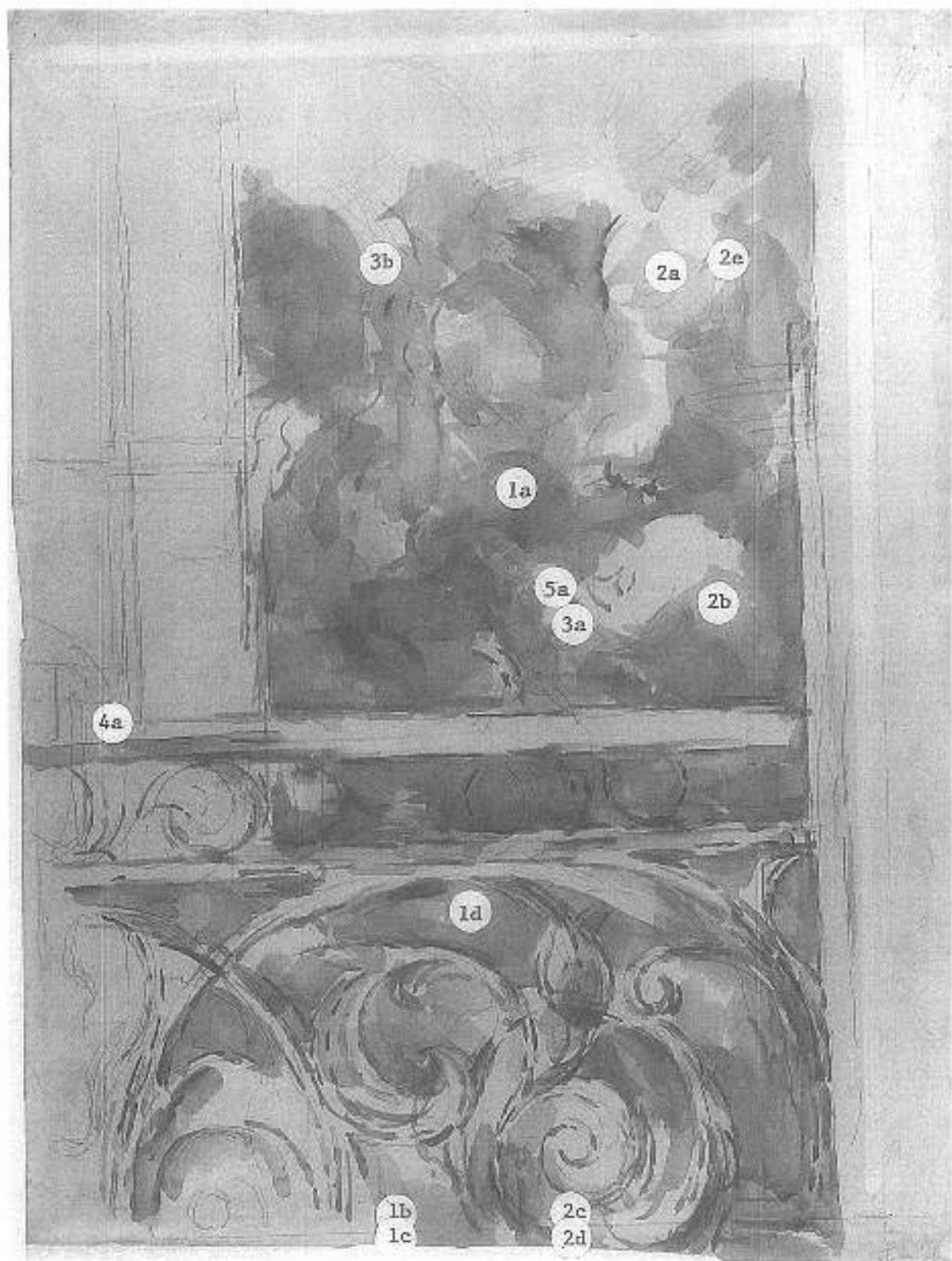
Fig. 1. The Bohemian (43-75-1) with marked sites for x-ray fluorescence analysis. The results corresponding to the locations are noted on Table I.