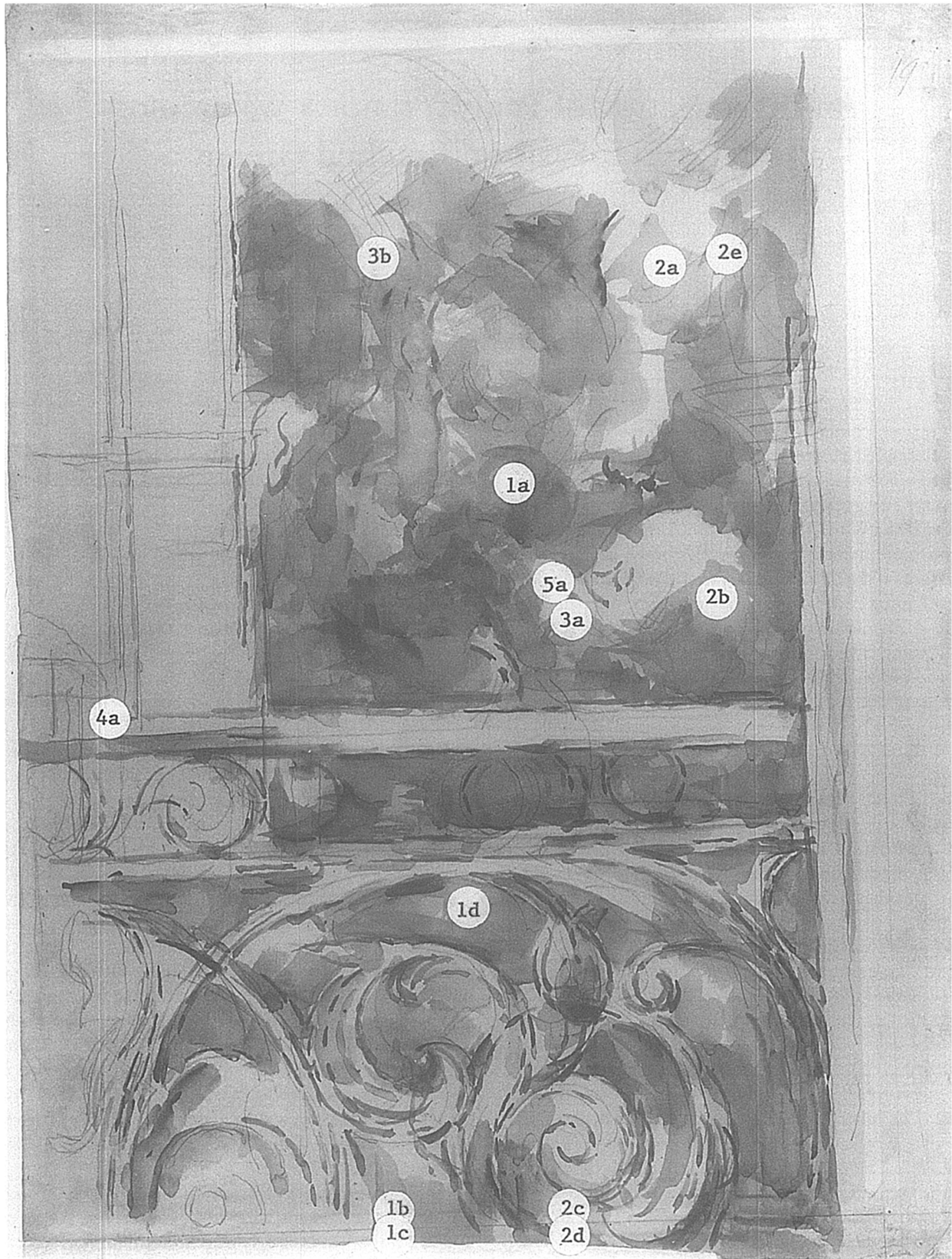
Fig. 1. The Balcony (43-75-1) with marked sites for x-ray fluorescence analysis. The results corresponding to the locations are noted on Table I