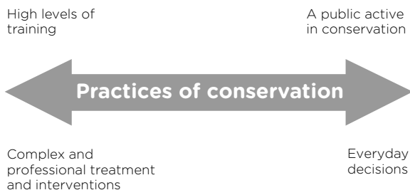
Figure 2 The spectrum of conservation

A spectrum runs from the high-level practice of skilled, professional experts, through to the more everyday decisions that we make in our daily lives (figure 2). Ultimately, the decisions made at the most technically adept levels of the sector in the most highly professional contexts are based on the same values as those on which we all base our decisions, whether it be not to leave a photograph we like in the sun, or – in more everyday terms – not to drop litter on the street.