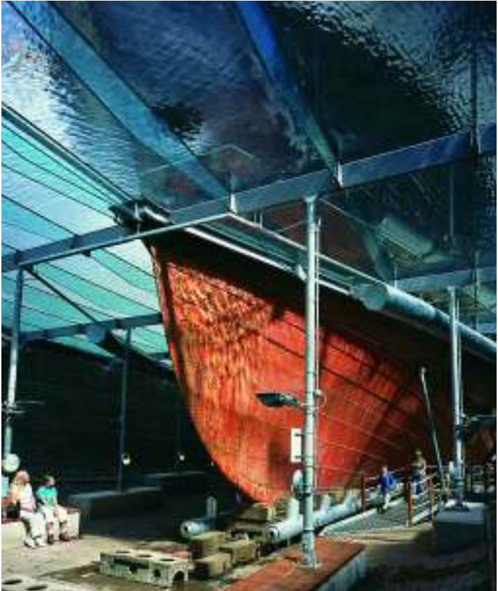
Photo 2 Conservation and display at the SS Great Britain