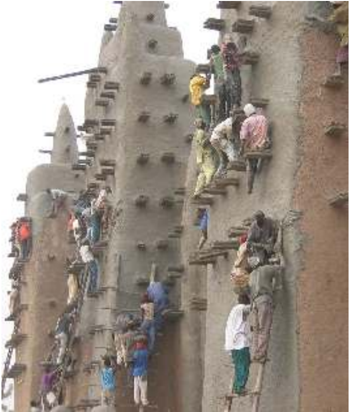
Photo 1 Ceremonial repair of the temple at Djenné