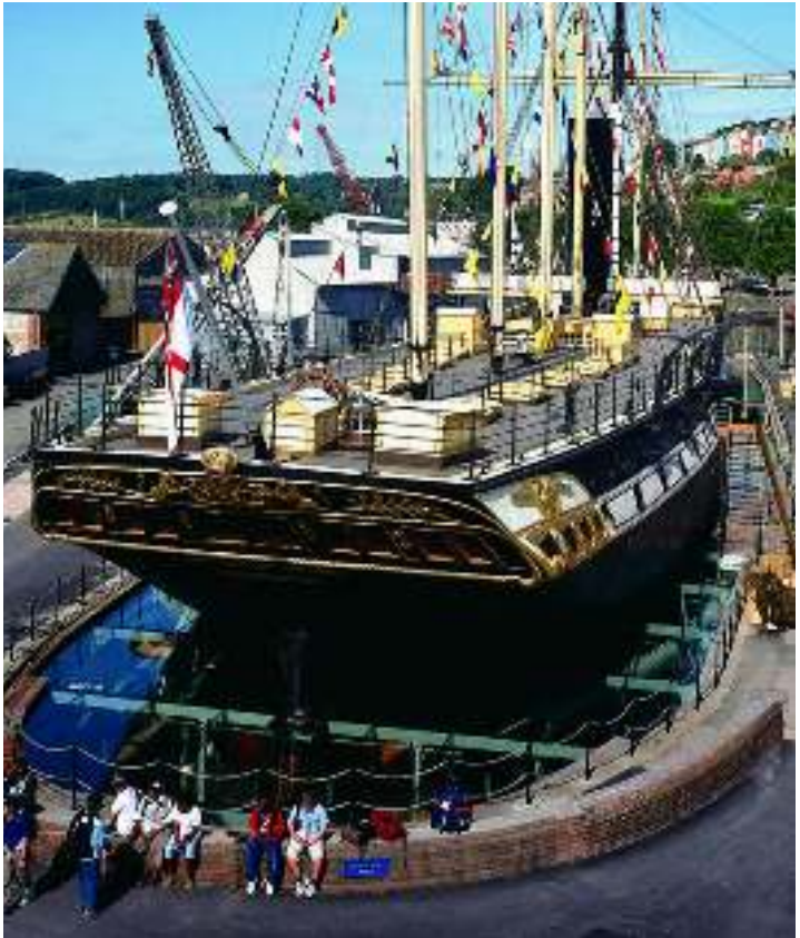
Photo 3 Conservation and display at the SS Great Britain