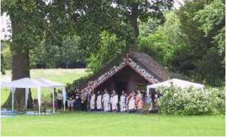
Photo 6 Members of the Maori community welcoming visitors to Hinemihi, June 2003