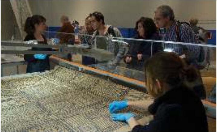
Photo 4 'Conservation in Focus' at the British Museum, © Trustees of the British Museum