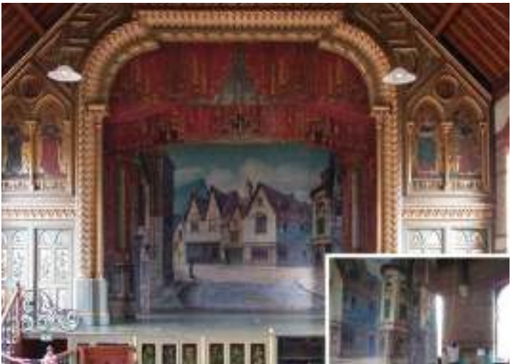
Photo 5 The conserved painted linen scenery at Normansfield Hospital