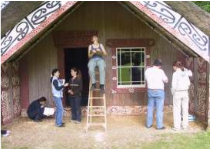
Photo 7 UCL conservation students conducting a physical survey of Hinemihi, June 2003