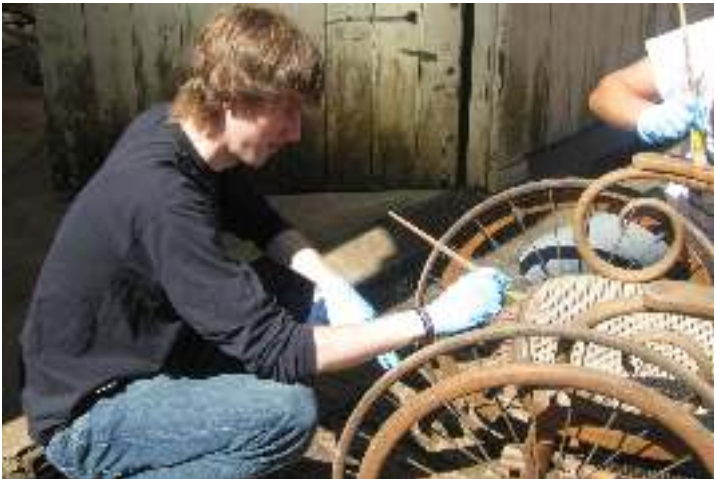
Photo 9 Volunteering at Tyntesfield